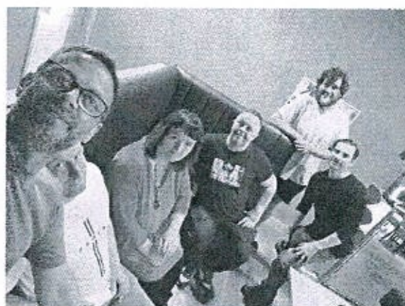
Celebrating Heart for Chorley Resident's 1 st anniversary

The relief of those in need by reason of addiction, criminality, unemployment, financial hardship, homelessness and those at risk of homelessness in Chorley in particular by the provision of recovery and support services and self-help coaching services designed encourage beneficiaries to assess their options, make more effective decisions and take ownership of their actions.