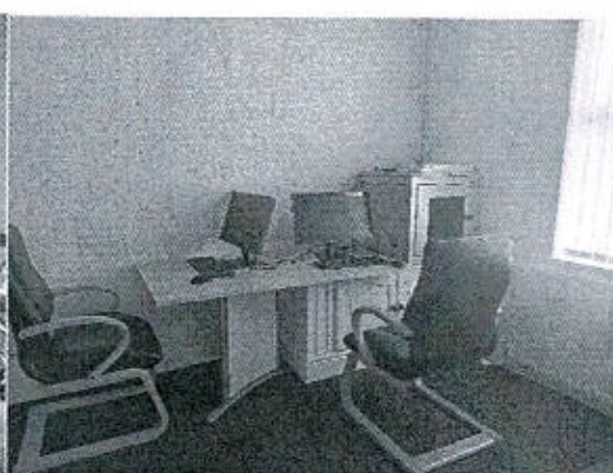
New computers for beneficiary use