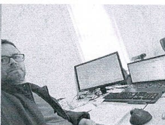
New Heart for Chorley staff office