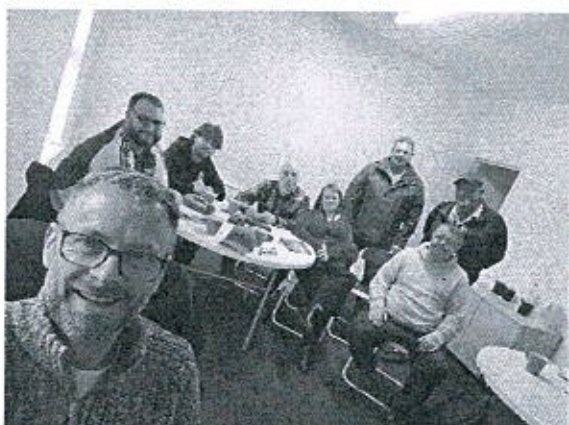
Heart for Chorley Personal Development Session