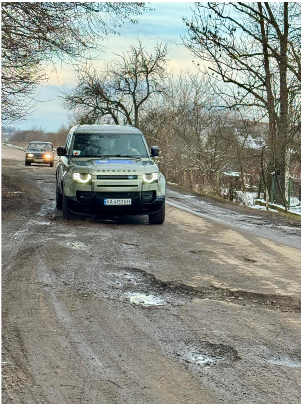
The Land Rover Defender on roads outside Lviv (Dec 2024)