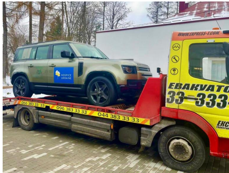
The Land Rover Defender arriving at Sambir Hospice, Lviv (Dec 2024)

In late December, a few days before Christmas, two of our trustees, Rachel Clarke and Henry Marsh, delivered the Land Rover to Sambir Hospice, where it has been used ever since to provide palliative care to patients in their own homes.