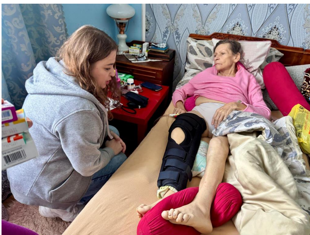
Sambir palliative care consultant treating a patient outside Lviv thanks to the Land Rover – shared with patient permission (Dec 2024)