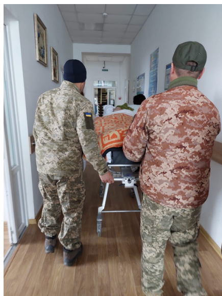
Wounded soldiers from the frontline arriving at Sambir Hospice, Lviv