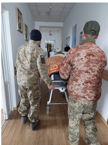
Wounded soldiers from the frontline arriving at Sambir Hospice, Lviv