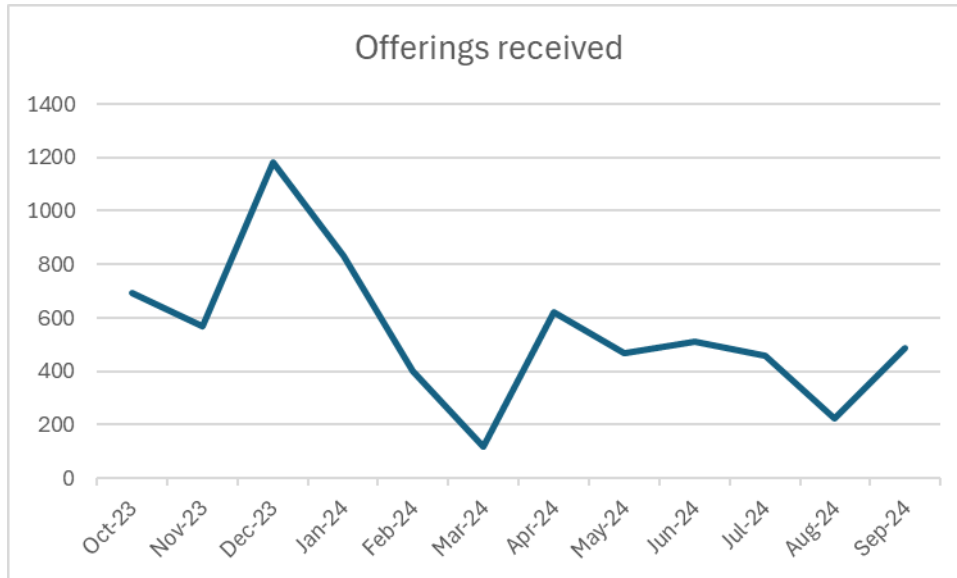
Graph 1: Offerings received.