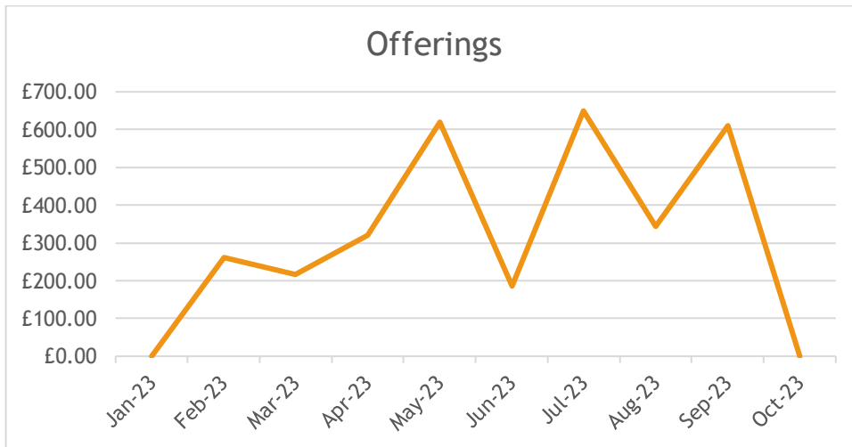
Graph 1: Offerings received.