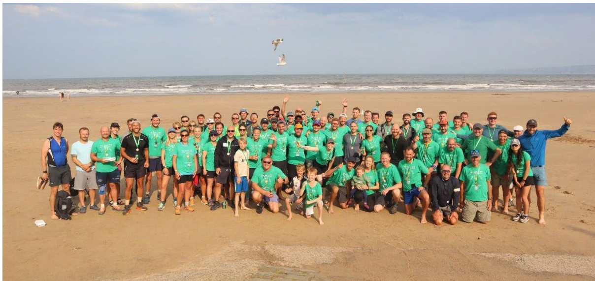
End of Day 3 – 100 WALK 100 – The Cleveland Way