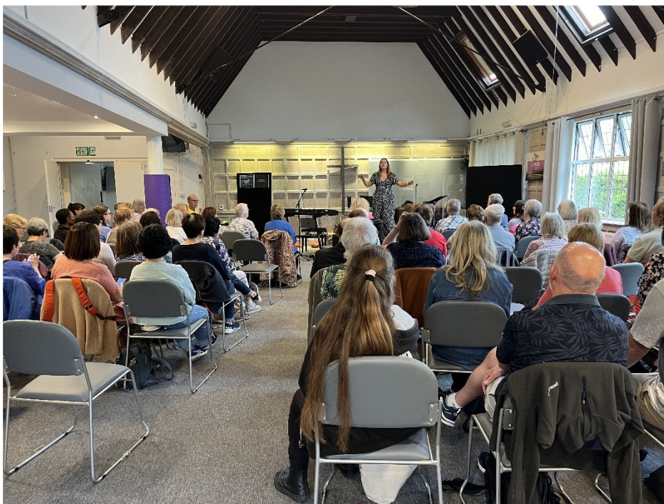
Everyone can Sing! Workshop day, September 2024