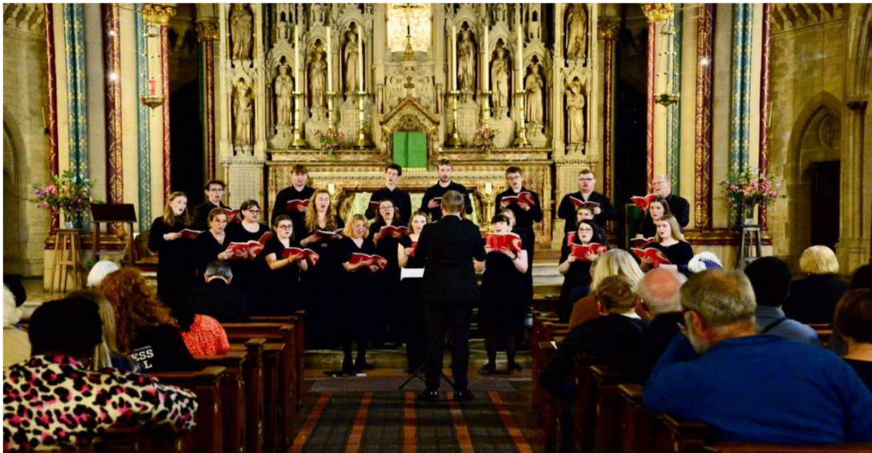
The choir of Salford Cathedral singing from Sacred Music by Women Composers Vol.1 at the launch of their CD and of the Salford Cathedral Music Foundation

'a statement of intent: it's a line in the sand. Rise Up" the album's title exhorts; now it's time for other churches and cathedrals to listen. Recent stats suggest that less than five per cent of classical music performed in the UK is by female composers. Why shouldn't choral music lead the way towards greater parity and representation? On the basis of the varied, accessible and appealing work recorded here, there's no shortage of music, just volition'.