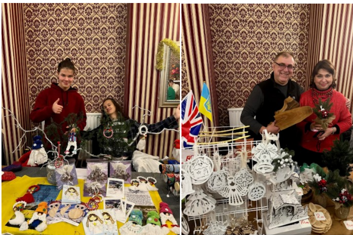
St Nicholas party seen children getting special Christmas presents delivered from Ukraine, reminding them of home and giving hope of happiness ahead.