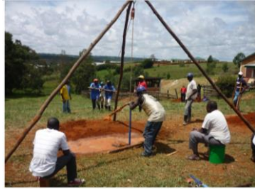
Drilling a 35 meter deep tube well with the SHIPO drill