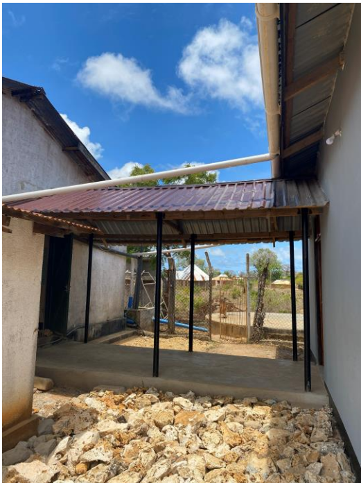
Covered walkway to the main dispensary