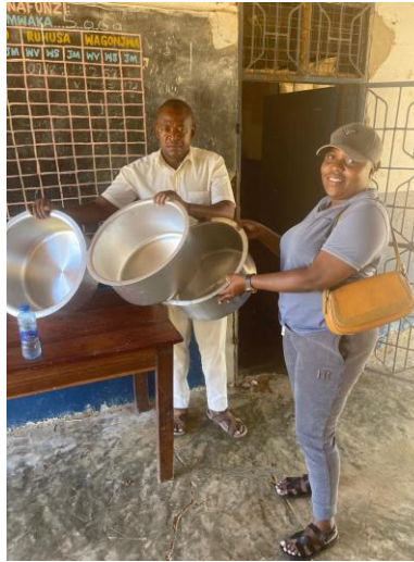
Pots supplied to Naumbu Primary school