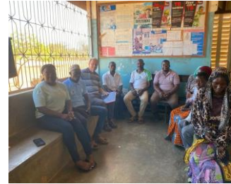
Naumbu village Soma Salama committee discussing needs

Outcomes are put to the Board for approval and decision making.