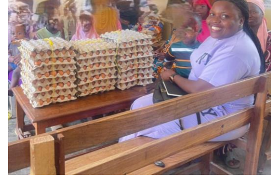
Eggs supplied to to the HIV children club Mikindani Dispensary