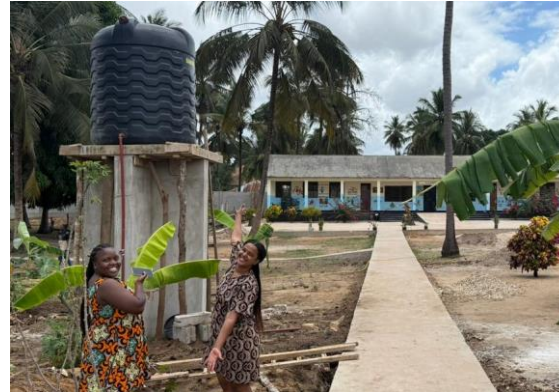
Shallow well and tank provided by ACT supplies freshwater on site for the dormitories, kitchen and vegetable garden