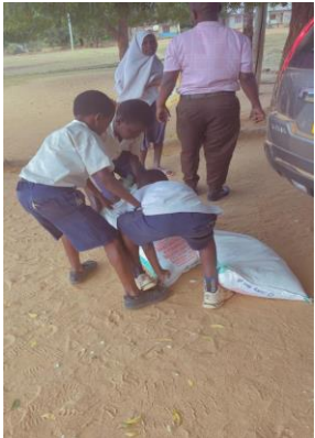
Some food support for Naumbu standard 7 pupils to support their learning