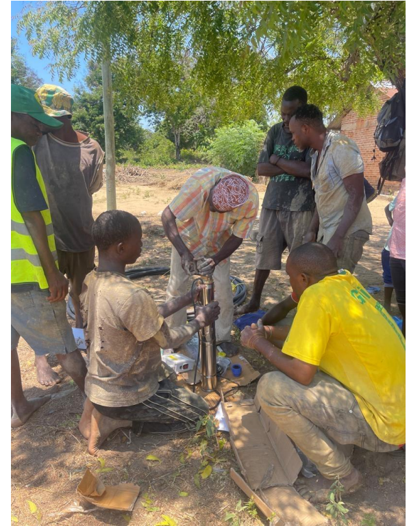
ACT trainees receiving training on inserting the pump