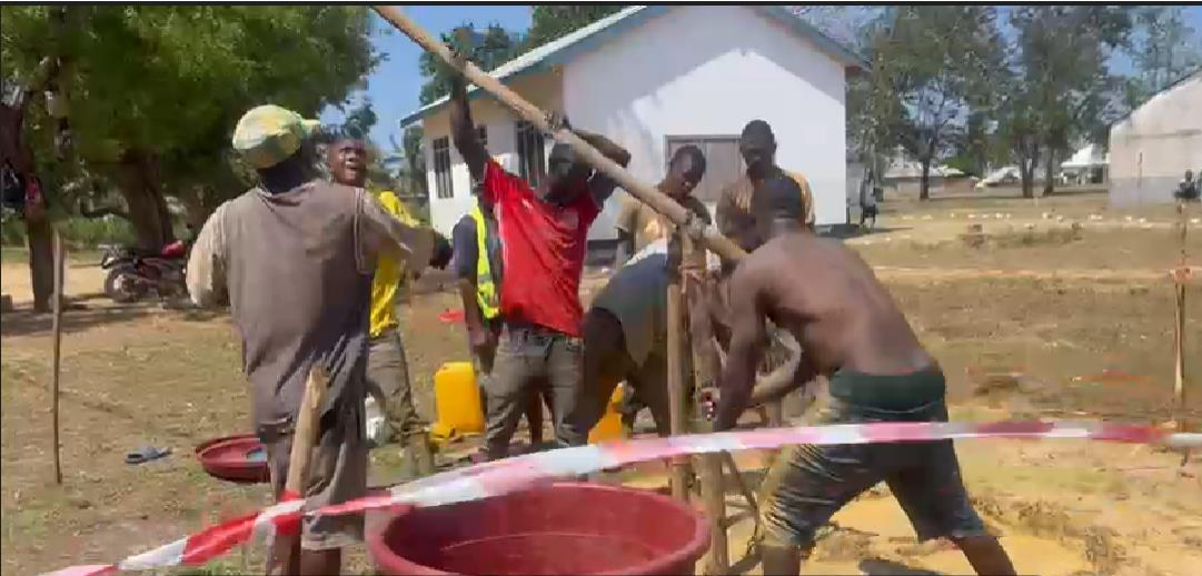
ACT trainees receiving training in hand drilling the well

ACT paid trainers from SHIPO -Tz an organisation with a long experience in training groups to train its own group. The aim is for this group to undertake water projects for ACT and for their own income generation.