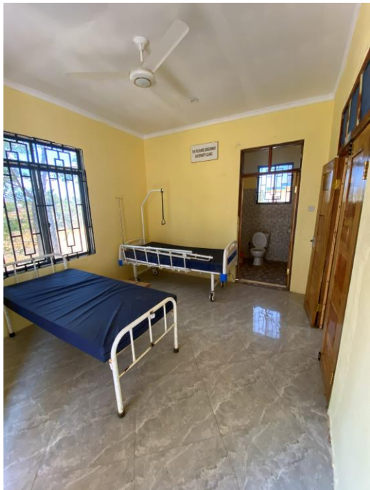
Resting room, electric fan, washroom, security bars with mosquito netting