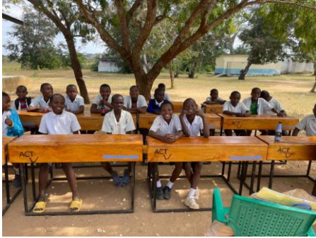
10 more desks supplied to Naumbu Primary school

Support for the HIV children club linked to Mikindani Dispensary Cost: TZS 728,000/-