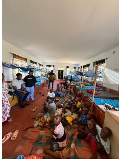
Children in one of the dormitories