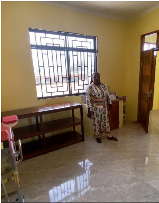
Delivery room with tiled flooring