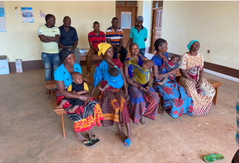
A completed Maternity ward in Mtwara region in 2021 which an ACT Trustee had personal knowledge and involvement in, and informed this decision