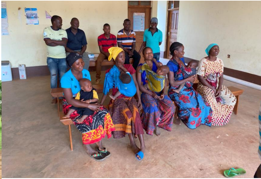
A completed Maternity ward in Mtwara region in 2021 which an ACT Trustee had personal knowledge and involvement in, and informed this decision