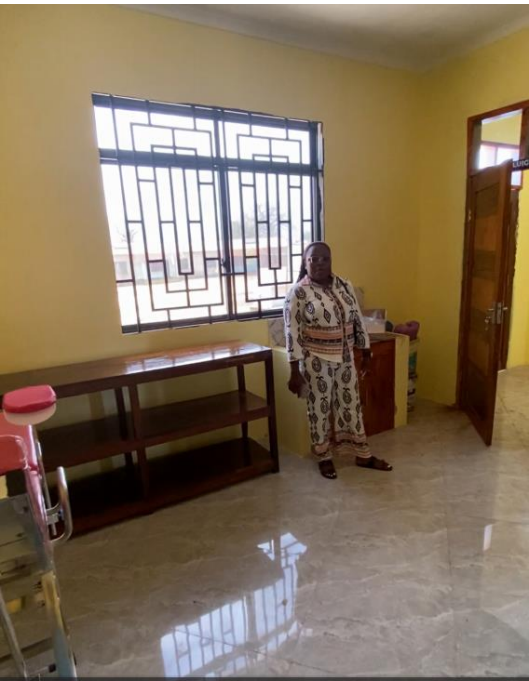
Delivery room with tiled flooring