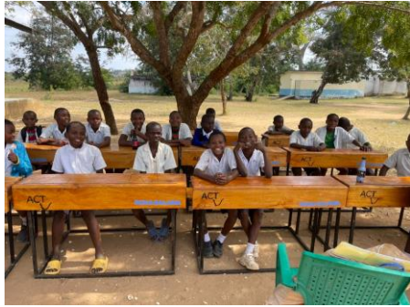
10 more desks supplied to Naumbu Primary school

Support for the HIV children club linked to Mikindani Dispensary Cost: TZS 728,000/-