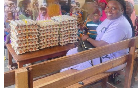
Eggs supplied to to the HIV children club Mikindani Dispensary