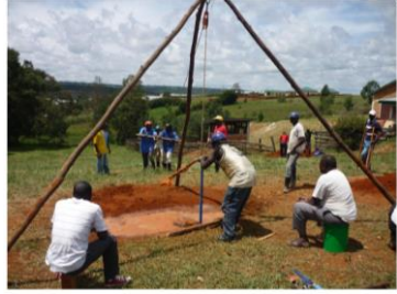
Drilling a 35 meter deep tube well with the SHIPO drill