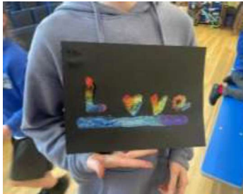
Holi Festival March 2024