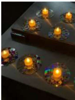
Our Diwali 2023 tea light creations