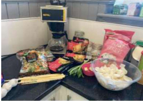
Vegetable stir-fry for snack