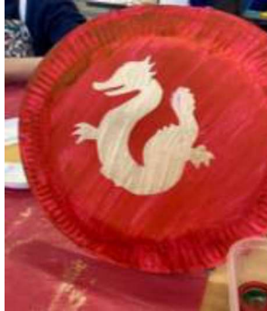
We made Chinese dragon drums