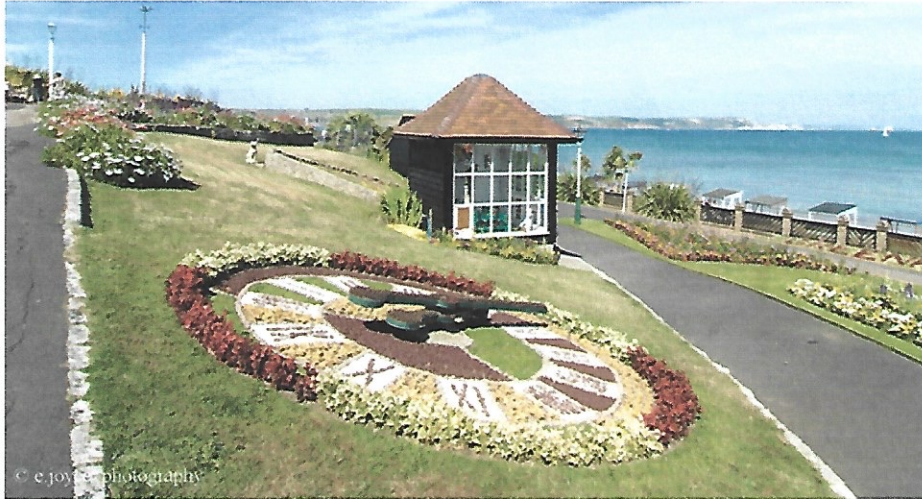
Floral clock and the new clockhouse in May 2024

The project to restore the 1936 floral clock has continued throughout 2023-4. This floral clock with its original mechanical clockworks is now believed to be the last remaining example in Britain. The restoration, costing in excess of £40,000 has been in 2 phases.