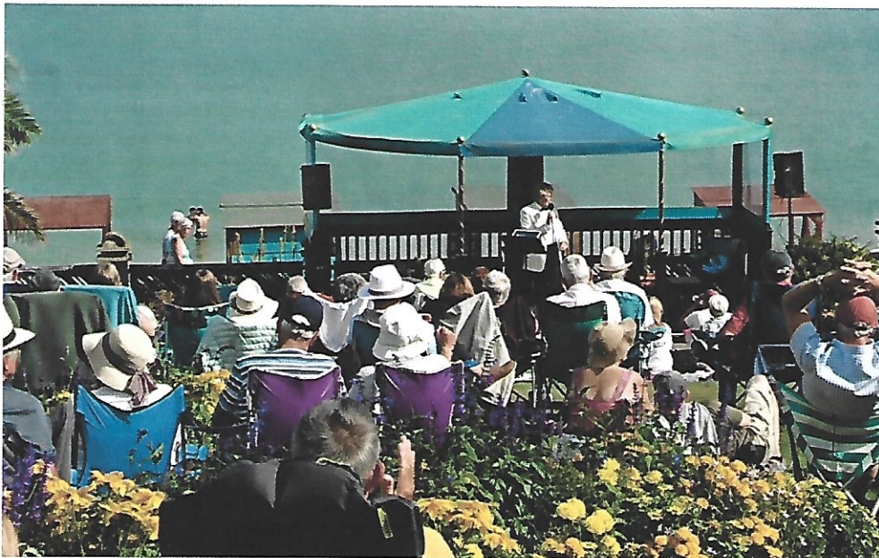
Summer concert in the gardens

The provision of live music, free to the public, has been a key objective for FOGG, and a bandstand in Greenhill Gardens was erected in 2014 and has hosted well over a hundred concerts. The bandstand was simply constructed to test the level of public support, which has proved to be substantial. With increasing signs of wear, it has been decided to replace the bandstand with a more permanent structure. This will be another major project for FOGG. With provisional go-ahead of Weymouth Town Council and our many supporters we are confident that we can achieve our aim over the next few years.