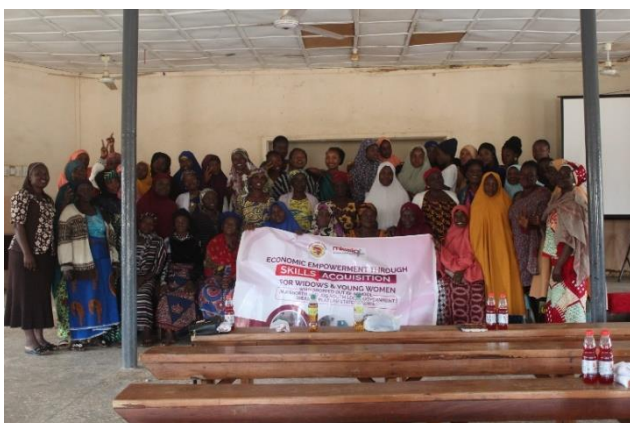
Financial Literacy workshop

A graduation ceremony was held on 31 October 2023 and was attended by 25 widows and 24 young girls, who all received starter packs and delighted in their newfound skills. The event was attended by community leaders of Tudun Wada, Congo Russia, Dadin Kowa, Bulbula, Angwan Keke and the Commissioner of Youths and Sports.