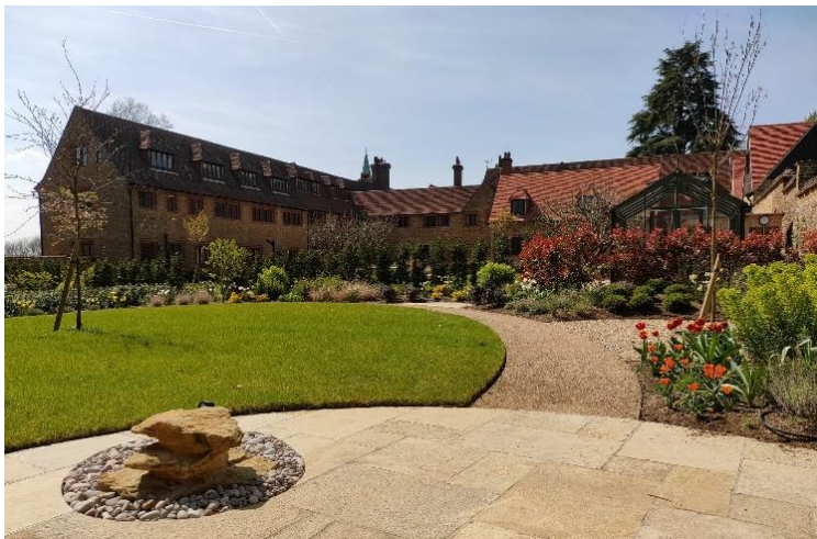
The Franciscan Centre

The Franciscan Centre Ladywell (FCL) has been created to allow people from all walks of life to be with God and engage closely with the Franciscan charism generally and as lived from the perspective of the Franciscan Missionaries of the Divine Motherhood. It offers a welcoming, prayerful and reflective space to invite guests to spend time with God. The Centre provides chapels, reading rooms, sitting rooms, dual purpose conference rooms, a shop for books and goods and a refreshment area.