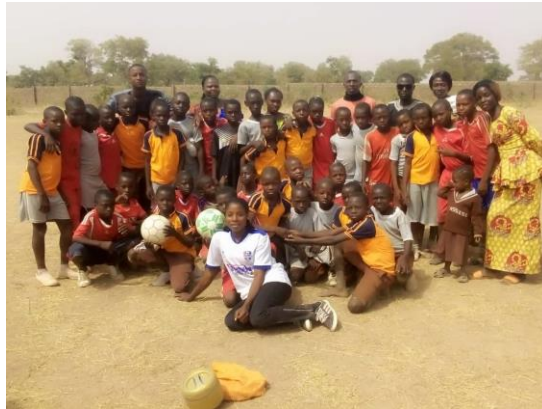
The winning football team

School has grown during the 2023/2024 term, with 340 children and 22 staff. During the academic year the pupils have enjoyed experiences to broaden their horizons, they went on school trips to Quan-pan and Damiano farm, learnt about the founding journey of the FMDMs and won a football match against a local high school team, scoring two goals to nil. During 2023, the Assisi Primary school had its first graduation and speech day with a prize giving for its pupils. As with the farm in Kasanka, Zambia, there is close engagement with the parents and the community on various health and safeguarding initiatives.