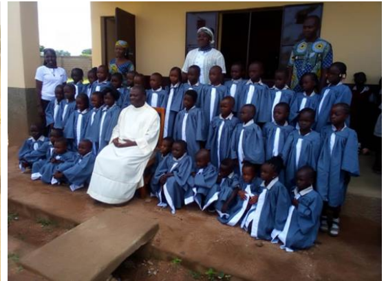
First graduation and prize giving at Tunkus School