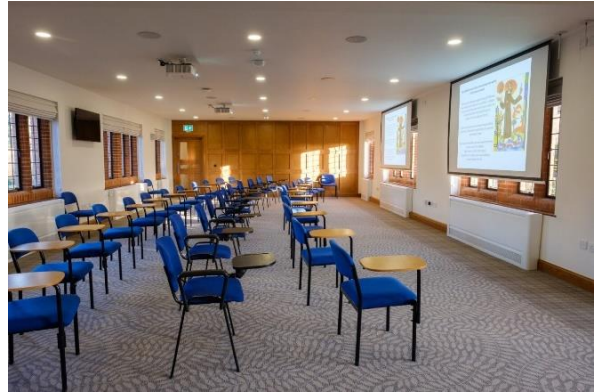
Duns Scotus Conference room at Ladywell