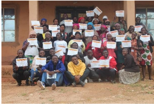
June Trauma workshop in Dogo Na Hawa