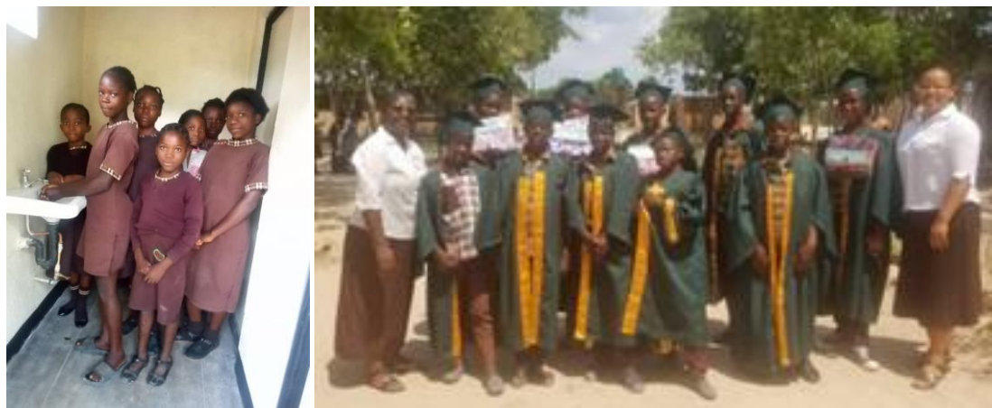
The new facilities at the St Francis Community School, Kasanka and the first Graduation Day in October 2023

ZAMBIA – The Charity also runs St Francis Primary school in the rural village of Kasanka. In 2023 the school had 265 students and 12 staff members. The Charity engages closely with the parents and the children, who come from Kasanka and the surrounding villages on various health awareness and safeguarding initiatives. The school was generously supported by St Edmund's Parish in Godalming, who provided the funds for a drip irrigation system, which will enable the school to be self-sufficient, producing tomatoes, rapeseed and maize. Surplus crops will be sold to the local community and the profits will be reinvested in the school. The children also benefit from learning about basic agricultural skills in the school garden. A significant improvement over the year has been the installation of a toilet block, funded by FMDM, which has greatly improved hygiene and created an enhanced learning and work environment.