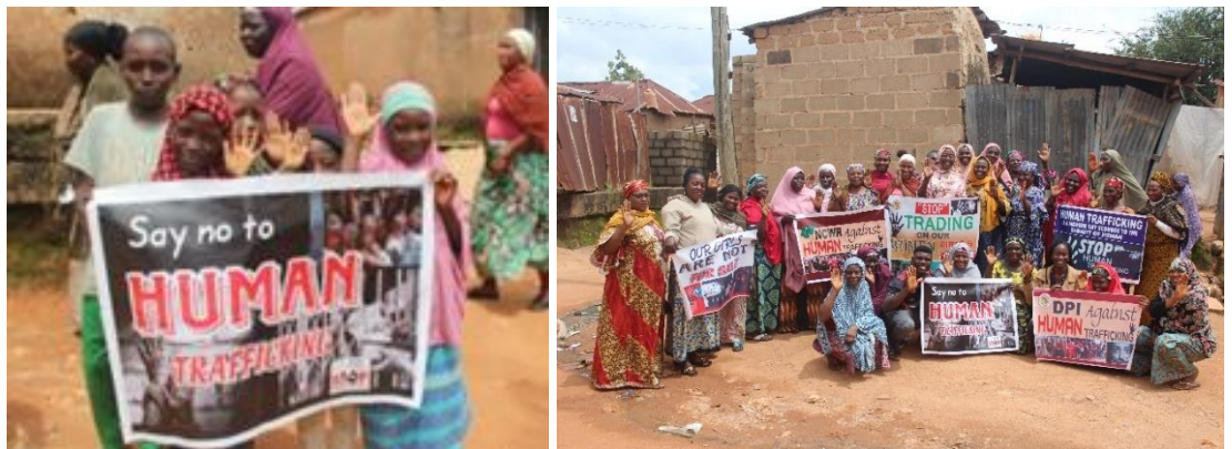
Creating awareness of Human Trafficking in Plateau State

Examples of the training on offer were a 3-day Trauma workshop, held in June for 30 beneficiaries of men, women and youths in Dogo Na Hawa, Plateau State. The sessions helped the participants understand and cope with grief and loss, develop a mutual support group between themselves and improve their confidence and self-worth to feel positive about the future. 30 beneficiaries also benefitted from the 3-day workshop on Human Trafficking sponsored by Arise and learnt how to report any form of trafficking that took place in their communities via the National Agency for the Prohibition of Trafficking in Persons (NAPTIP).