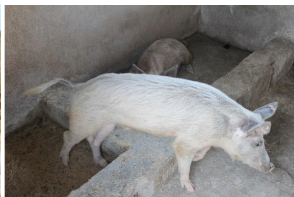
The piggery at Tunkus farm

The Kasanka farm has good quality soil for arable use. In 2023 the farm produced maize, beans, sweet potatoes and groundnuts. The farm covers several hectares, and it aims to use sustainable farming techniques, to provide food for the school children and also to become a sustainable social enterprise.