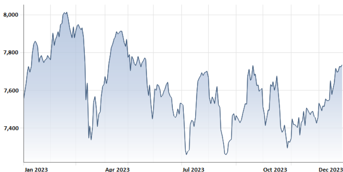
UK FTSE 100 Stock Market Index

Whilst capital growth is beneficial to the Charity, it should be remembered that the key element to our investment strategy is to maximise long-term total return.