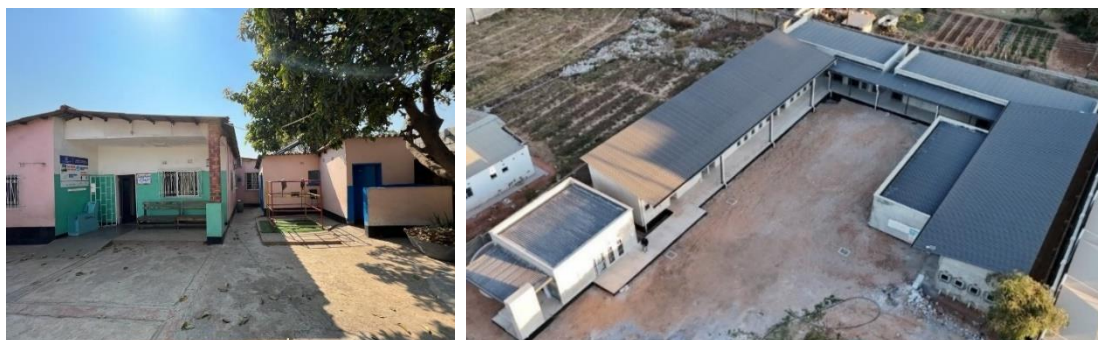
On the left, the existing Little Assisi Day Centre & Special School, with the new, purpose-built school on the right

The construction of the new school has entered its second year, and the facility will become functional in 2024 and will be completed in 2026. The children will enjoy state-of-the-art facilities, including autism sensory rooms, physio and occupational rooms, computer rooms as well as play equipment. This project has been enabled through the generous funding of Misan Cara, the Congregation, the Hilton Fund for Sisters, MZF Missionszentrale der Franziskaner and from private donations, friends and relatives of the Sisters, as well as from individuals and business entities in Zambia. Staff have been acquiring ongoing professional training and development in preparation for this new purpose built school.