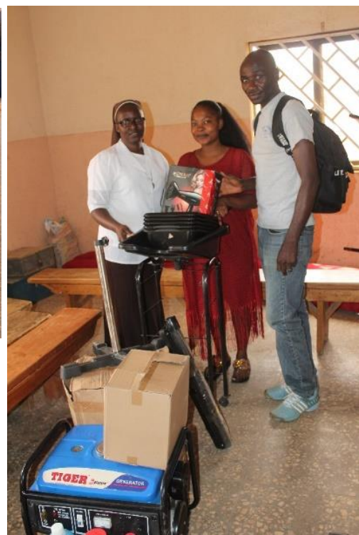
Distribution of hairdressing starter packs to beneficiaries