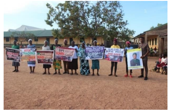
Sensitization on Human Trafficking in the Dong community

DPI activities in Plateau State included visits to the Young People's Home every Wednesday and to the Jos prison every Thursday. A variety of PACT groups achieved great successes: as part of the core value of caring for the environment, the Angwan Doki Ladies PACT was commended by the community leader for organising a sanitation exercise to clear communal land that had been used as a dumping ground and clearing blocked drainage. In addition, the Sacred Heart School PACT of Rantya cleared drains and repaired the roads near the school. Both achievements made a significant impact on the local area.