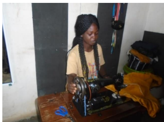
6-month skills acquisition tailoring training