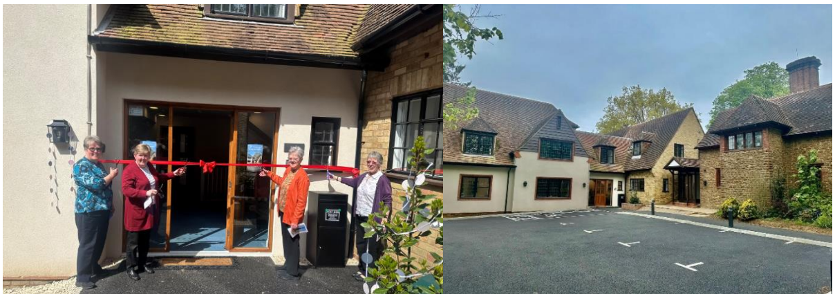
The CLT opening the new St Francis building, May 2024

The 11-month refurbishment project of the St Francis building at Ladywell Convent commenced in May 2023. The aim of the project was to extend and improve the office space and parking for the growing team of FMDM support staff who act as the central hub to support the 3 separate CIO's. The project also created the Gate House as a separate 3 bedroomed dwelling, to provide accommodation for families and visitors of the Sisters.