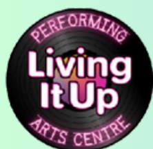
PAC Staff and Volunteers