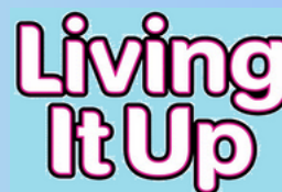
Events Staff and Volunteers