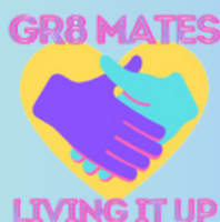
Gr8 Mates Staff and Volunteers