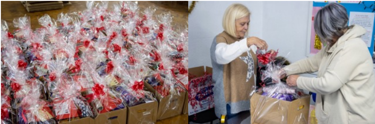
Christmas Hampers Appeal December 2022

This year with the help of local businesses we delivered 545 special Christmas Hampers during our annual Christmas Hamper Appeal. This year we were able to raise a double amount of money to provide each household receiving the hamper with £25 supermarket vouchers, to further relief the financial pressure on families due to the cost of living crisis. We were supported by 65 dedicated volunteers from the local area and from 15 local businesses. St Agnes Church kindly provided their facility for us to pack and deliver hampers from and B&M stores provided all the food at a discounted price. IKEA provided free boxes, and SKY TV supported us with 5 engineers with vans to help deliver the hampers.