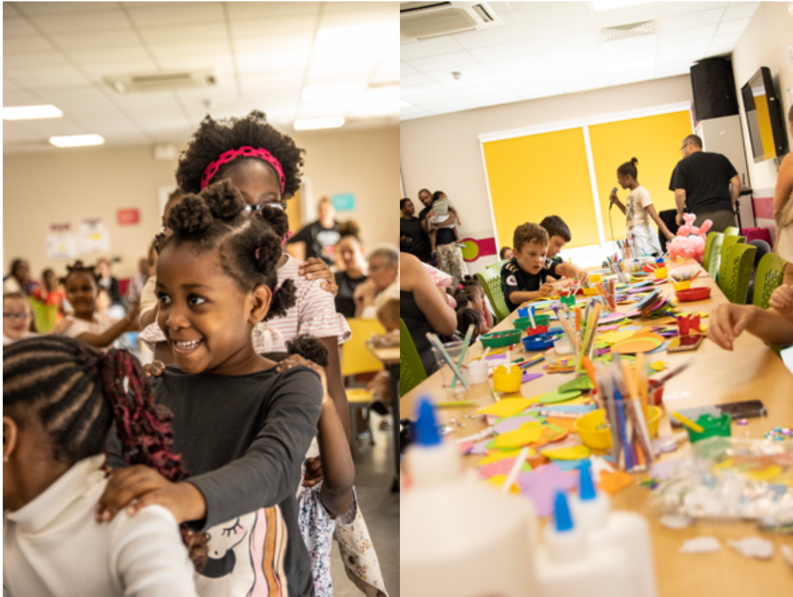
Summer Community Fun Day August 2022