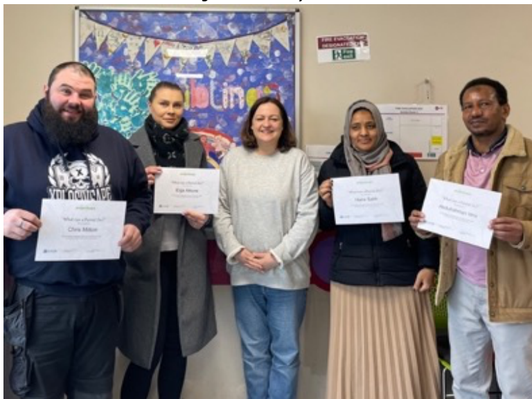
PEEP Group September - November 2022