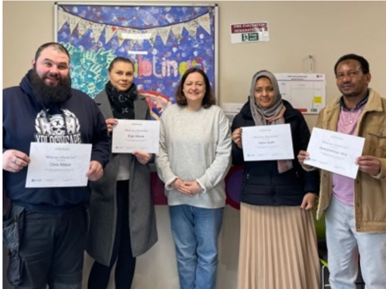
PEEP Group September - November 2022