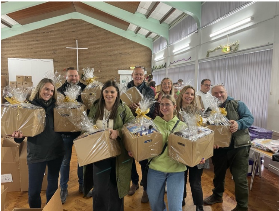
Christmas Gifts ITV's Emmerdale December 2023

Project Hope Leeds and ITV's Emmerdale team joined forces this Christmas to ensure that no child and young person we support goes without a gift this Christmas. The Emmerdale team have auctioned the costumes from the show and used the proceeds to purchase, wrap and deliver 298 gifts. These included a toy, chocolates and pyjamas for each child. The team also helped us to deliver some of the Christmas Hampers.