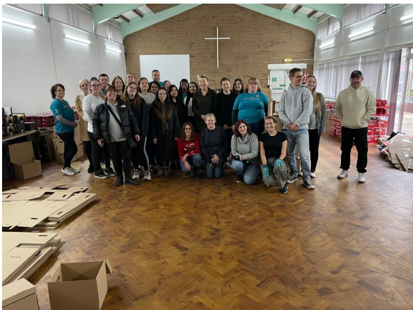
Christmas Hampers Appeal - December 2024

Special Thanks to: Binary Consultants, Liberty Global and High Speed Training Limited for their generous donations to the Christmas Hampers Appeal; B&M store for helping us shop for hampers items; Galaxy Insulation for providing lorry and fork lift truck complete with Santa to make moving of 7800 items that make up the hampers super easy; IKEA for continuing to supply us with their boxes; The Circuit for allowing us to use their delivery app for free; Milestone for organising a fork lift trolley and disposal of the pallets; Leeds City Council – Cleaner Neighbourhoods Team for collecting and disposing of all the packaging refuse; SKY for sending their engineers to help deliver the hampers; Irwin Mitchell Solicitors, Liberty Global, TRU (East Alliance), ITV, SSE Thermal, High Speed Training, Turner & Townsend and Equans for continually supporting us with the wonderful volunteers.