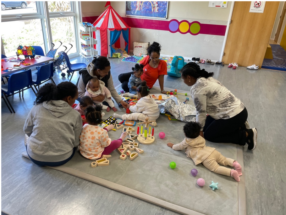
PEEP Group Sept – December 2023

“I have learned how to help my child to feel their feelings and different methods of playing and approaching my child”