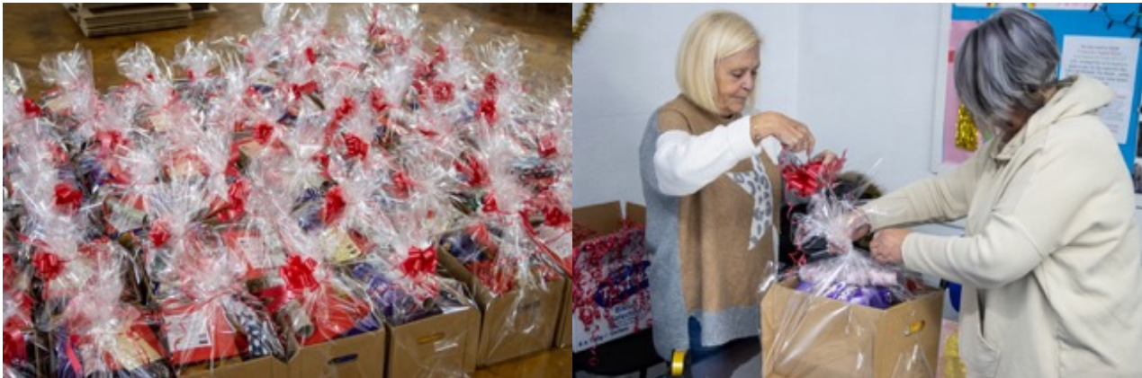
Christmas Hampers Appeal December 2022

This year with the help of local businesses we delivered 545 special Christmas Hampers during our annual Christmas Hamper Appeal. This year we were able to raise a double amount of money to provide each household receiving the hamper with £25 supermarket vouchers, to further relief the financial pressure on families due to the cost of living crisis. We were supported by 65 dedicated volunteers from the local area and from 15 local businesses. St Agnes Church kindly provided their facility for us to pack and deliver hampers from and B&M stores provided all the food at a discounted price. IKEA provided free boxes, and SKY TV supported us with 5 engineers with vans to help deliver the hampers.