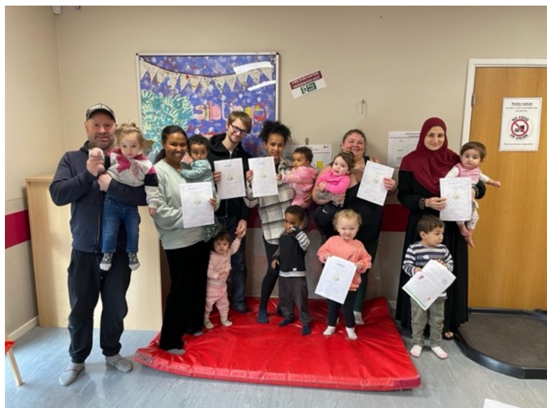
PEEP Group Sept – December 2023

"I have learned that reading is learning and about good foods and children's emotions. I liked interacting with other mums"