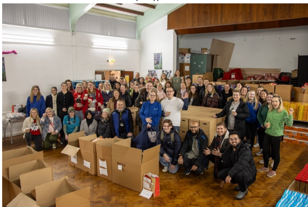
Christmas Hampers Appeal - December 2023

We are grateful to: B&M store for making hamper's shopping super easy this year; Sainsbury's Colton for their super generous donation to the hampers appeal; Galaxy Insulation for allowing Santa to drive and pack and unpack their lorry; IKEA for continuing to supply us with their boxes; the Circuit for allowing us to use their delivery app for free; Milestone for organising a fork lift trolley and disposal of the pallets; Leeds City Council – Cleaner Neighbourhoods Team for collecting all the packaging refuse; SKY for their engineers with vans being super deliverers and to Irwin Mitchell Solicitors, Liberty Global, TRU (East Alliance), ITV, SSE Thermal, High Speen Training, Ison Harrison Solicitors and Turner & Townsend for continually supporting us with fundraising and sending us all their wonderful volunteers.