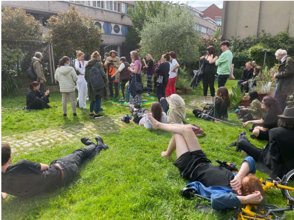
Visitors participating in Ferret Roulette held in Meanwhile Gardens