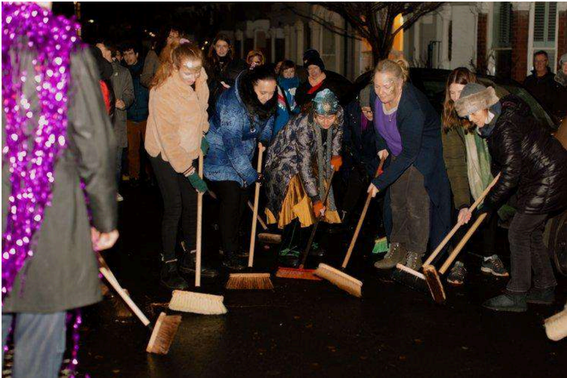
Local residents performing the Hornead Road Stomper at A Verry Gerry Christmas 2024!

The event brought together a wonderful mix of ages and backgrounds, reflecting the rich diversity of North Paddington. Feedback was overwhelmingly positive, with many praising the event as a shining example of brilliant creativity and imaginative community inclusion in the area.