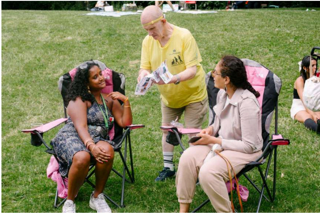
Pursuing Independent Pathways (PiP) staff and service users manning the Gig Buddies stand at the Alternative Village Fete. Gig Buddies is a befriending scheme for adults with learning disabilities, connecting them with volunteers to attend events together. It aims to foster social inclusion and help individuals with learning disabilities make friends and engage in activities they enjoy.