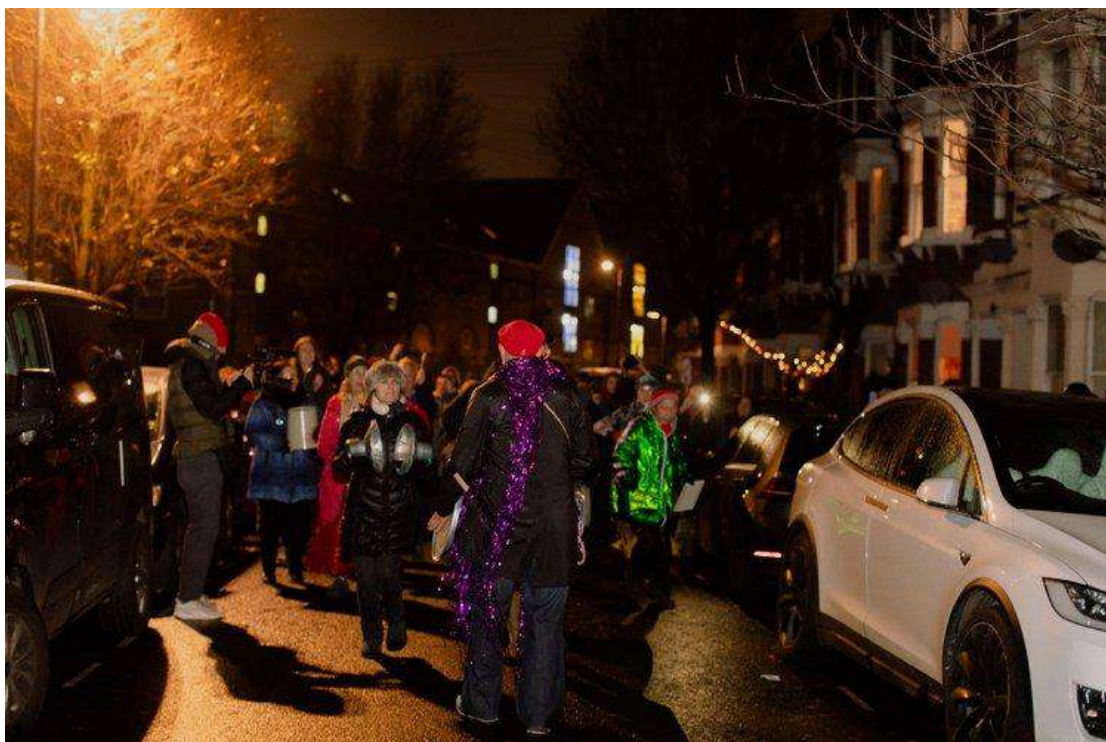
Visitors to A Verry Gerry Christmas 2024 processing from Gerry's Pompeii to No. 1 Horemad Road.