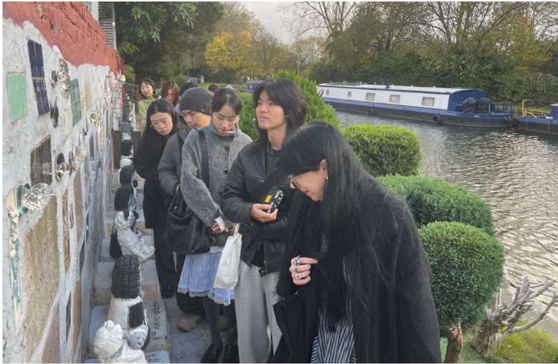
RCA, MA Sculpture students visiting Gerry's Pompeii