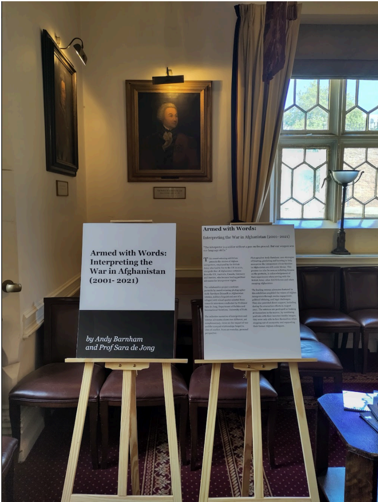
After a successful run at the British Academy, the Armed with Words exhibition went to the Fusiliers Museum at the Tower Of London.