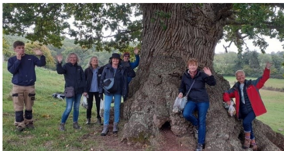
Seed collectors collecting ancient Oak acorns

every week with Volunteers from September to December. We collected 30,000 seeds in Winter 2021 and this increased to 100,000 seeds in Winter 2022. The Tree Production Capital Grant enabled us to buy a new van. The van has been critical to the operation of the charity and helps us transport tree seedlings, equipment and materials to the nursery network, but also it allows us to give lifts to people without transport to woodlands where they can enjoy the outdoors, learn new skills, tree ID and experience nature first hand. The van is also used during summer months for our “mobile volunteer team” who visit the community nurseries and provide some “summer respite” to the nursery-based volunteer teams. The van also enabled us to transport approximately 1,500 of our home-grown trees between February and March from all the nurseries and bring them to the two planting sites we identified this year on Whiteway Green and Axbridge Road public open spaces in Bath.