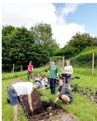
Community Nursery at Barrowmead