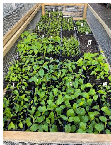
Cages providing protection from mice and squirrels.