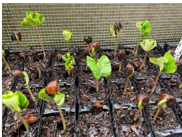
Root trainers with germinating locally collected beech seed

The Central Nursery Hub is currently located with the Council's Parks Depot who provided the accommodation free of charge and we are grateful for their continuing support. The Hub became a hive of activity during seed collection and processing season (September to December 22) and then through to June when approximately 3500 tree seedlings grown at the Hub were distributed to the new nursery network. New equipment was purchased for seed processing and a new fridge for storing seeds during winter (stratification). New cages were built for the nursery to prevent vermin from eating the seeds before the trees have had a chance to grow. The nursery was kitted out with reusable root trainers and peat free compost used across the board for germinating seeds, pricking out and potting on. The root trainers are easily transportable (opening up as a "book" to remove trees) and encourage healthy root growth, both features which make them a good choice for transferring tree seedlings out to the nursery network.