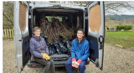
Transporting trees from Barrowmead Nursery