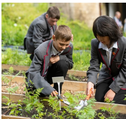
New tree nursery installed with Special Educational Needs centre at St Marks Senior School

Due to the enormous success of the project, More Trees decided to register as a new Charitable Incorporated Organisation in May 2022 and when the pilot project ended with Grow Yourself CIC in August 2022 took over the management and development of the Community Tree Nursery project. More Trees also began setting up all the necessary systems, administration and procedures required for the professional management of the charity and the fundraising and recruitment needed to support its work going forward.