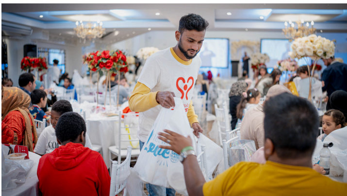
Zubeda Welcome volunteers

The charity's work has led to enhanced mental and emotional well-being, empowering participation in annual Quran recitals and Eid events.