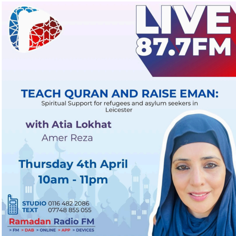
Ramadan Radio London