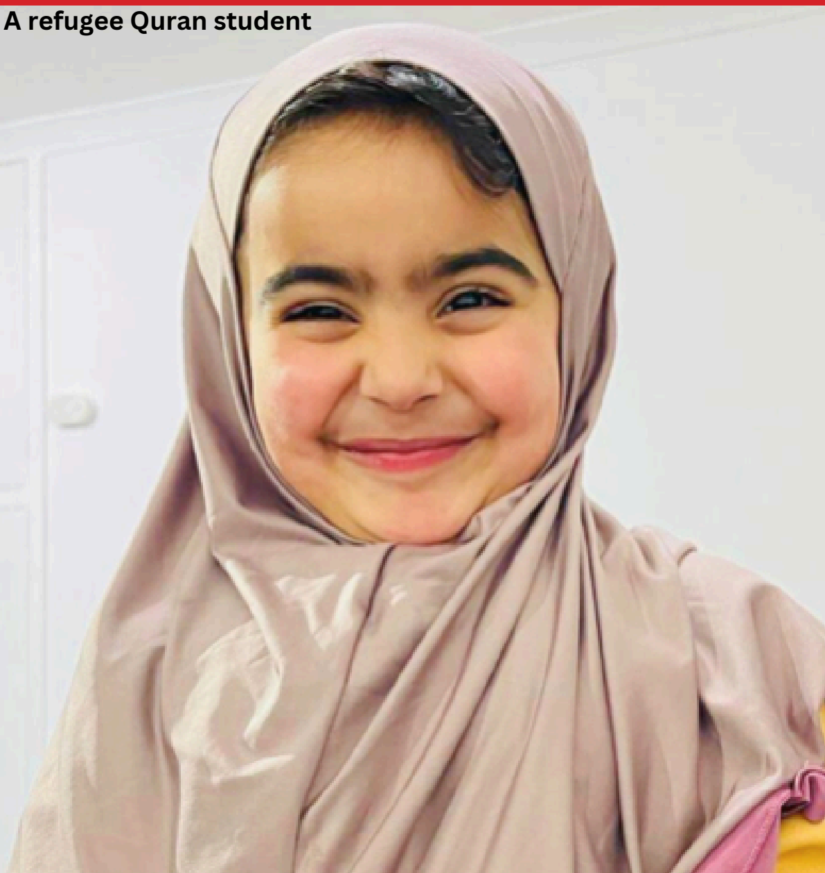
A refugee Quran student

The purpose of Zubeda Welcome is to support refugees in the UK, with a niche focus on providing access to high-quality Islamic education for vulnerable refugee and asylum seeker children. There are 365,000 displaced children in the UK - and over 85% of them are Muslim. The charity aims to preserve their faith and cultural identity, empower their spiritual and emotional well-being, and facilitate successful integration into British life.