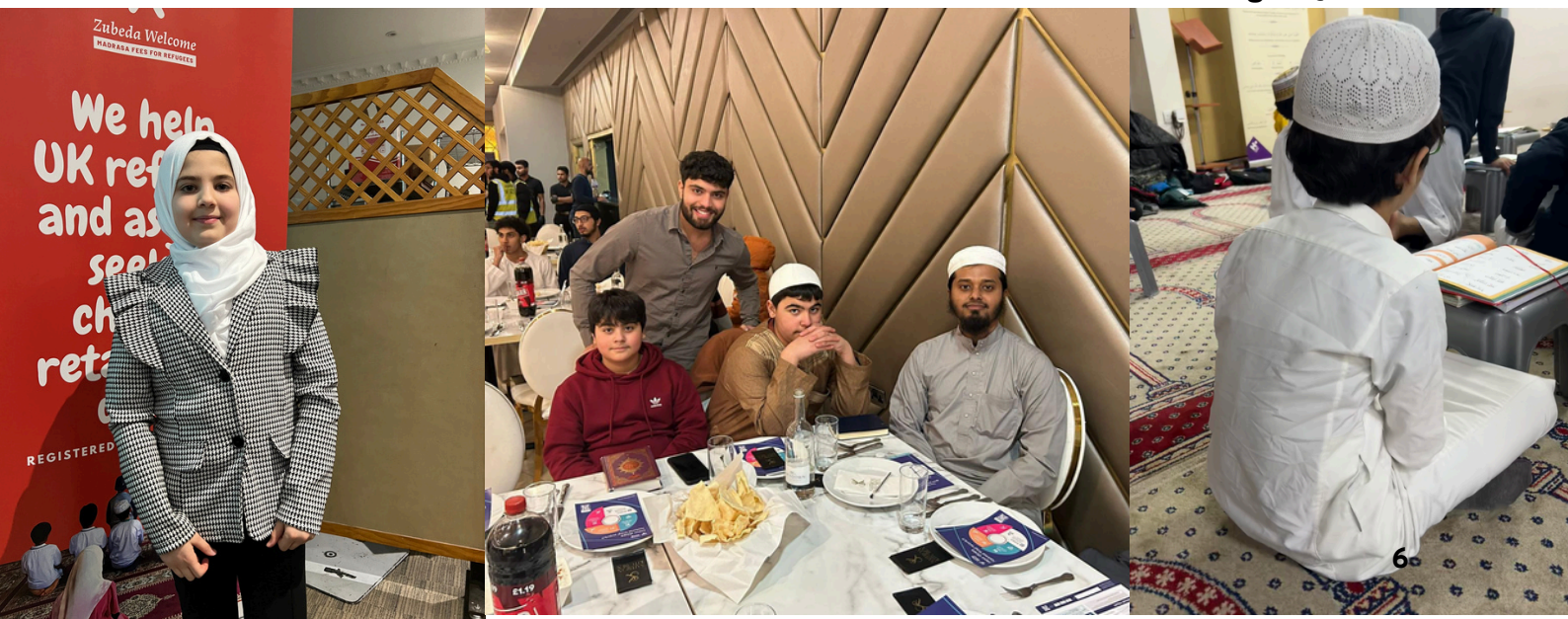
Zubeda Welcome team with our refugee Quran students

This year, we have introduced three key projects we are working on. 'Teach Quran, Retain Eman' which provides madrasa fees for refugee and asylum seeker children. 'Counseling for Quran students', where we aim to provide support for refugee children who are tackling the trauma of displacement and loss, and our 'Empowerment programme' where we provide our Qur'an students with recognition and achievement which can pave their way to better opportunities.