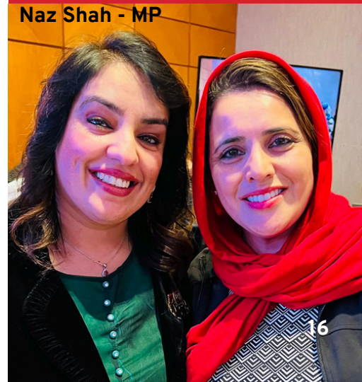
Naz Shah - MP