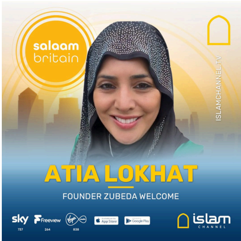
Multiple appearances on Islam Channel UK