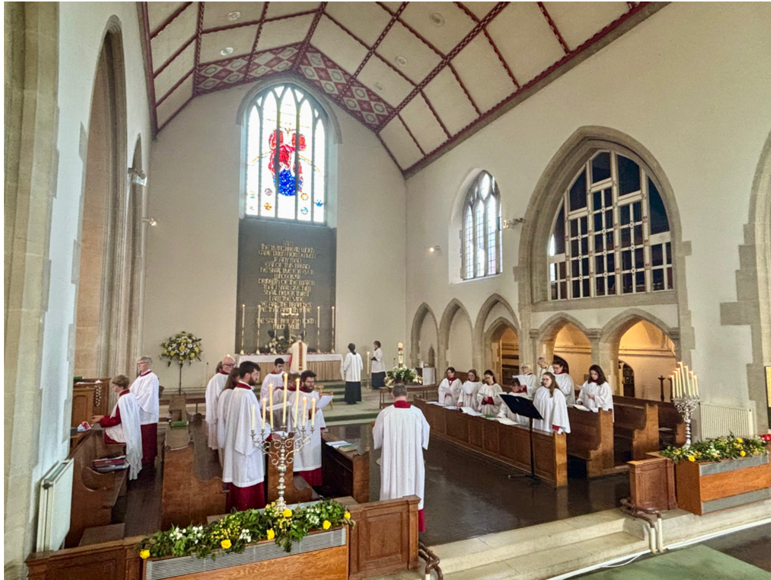
Ascension Day Mass, 2025