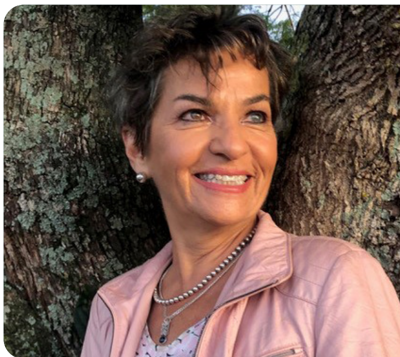
DAME CHRISTIANA FIGUERES