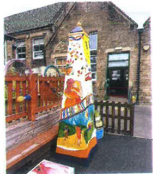
One of the obelisks at Ability Options, Holmfirth

This was followed in April to June 2023 with a second commission by Carlton School for the creation of a warrior figure drawn from Japanese history to enliven the children's study of history from the region. This involved workshops with the children as they contributed their ideas on how each part of the figure was to be developed and delivered.