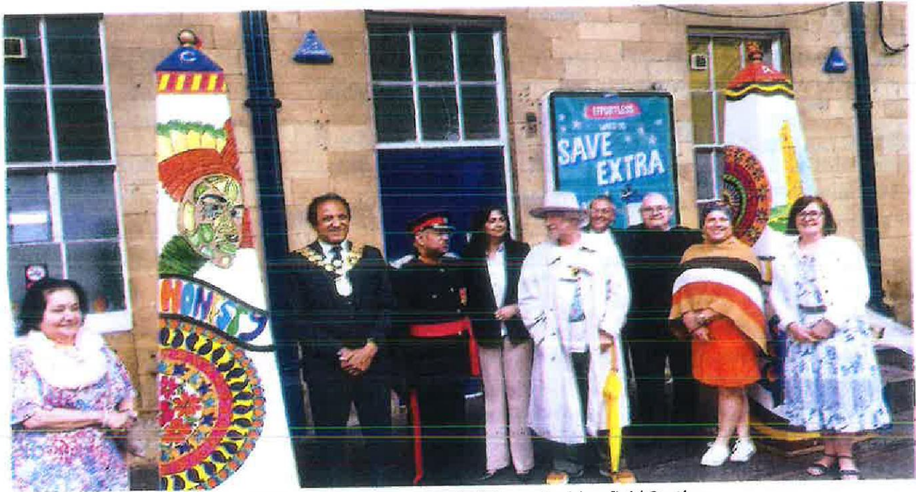
The opening of the display of obelisks at Huddersfield Station

This theme was carried on with a project for Ability Options, a charity based in Holmfirth with the purpose of assisting adults with learning disabilities & additional needs.