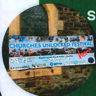
St Margaret's, Mountain Ash was chosen as one of Diocese's Churches Unlocked