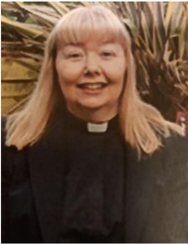
Senior Pastor and Chair of Perry Beeches Baptist Church Trustees

Welcome to this year's Annual Report and Financial Statements. I share the best wishes of everyone at Perry Beeches Baptist Church to those reading this report.