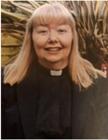
Senior Pastor and Chair of Perry Beeches Baptist Church Trustees

Welcome to this year's Annual Report of the Trustees and Unaudited Financial Statements for the financial year ended 31 st March 2023. Let me start by sharing the very best wishes of everyone at Perry Beeches Baptist Church to those reading this report.