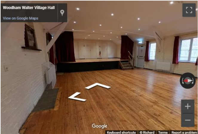
An immersive 360 tour of the hall published on our brand new website

Hall improvements: Water saving features introduced in the toilets. General maintenance improvements through regular working parties.