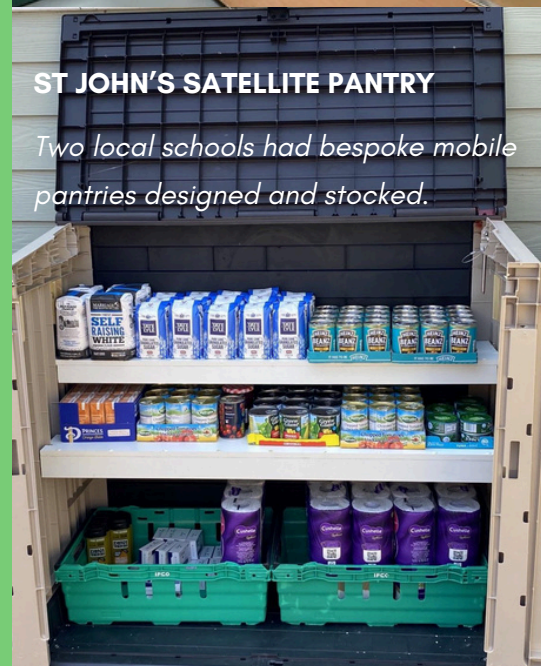
ST JOHN'S SATELLITE PANTRY

The Pantry receives food from local growing projects.