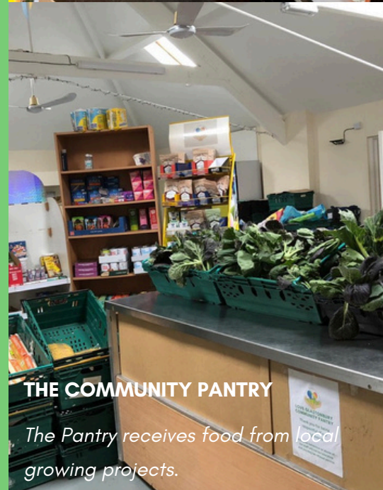
THE COMMUNITY PANTRY

Restocked daily, the fridge is open 365 days per year!