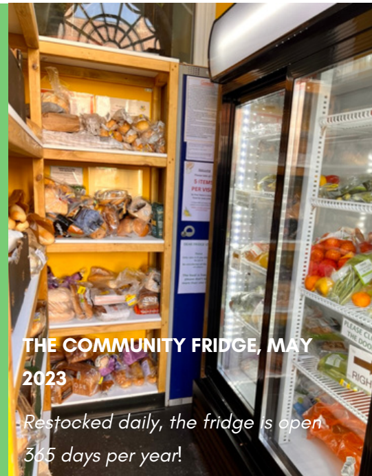
THE COMMUNITY FRIDGE, MAY 2023

These accomplishments would not have been possible without the tireless efforts of our dedicated team, volunteers, and supporters. We remain deeply grateful for their contributions and unwavering commitment to our mission.