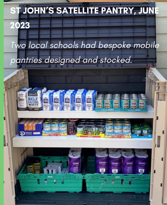
ST JOHN'S SATELLITE PANTRY, JUNE 2023

The Pantry receives food from local growing projects.