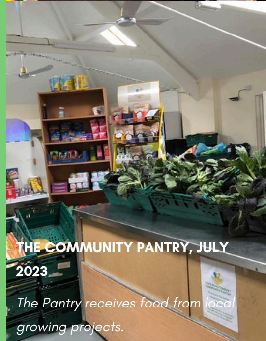
THE COMMUNITY PANTRY, JULY 2023

Restocked daily, the fridge is open 365 days per year!