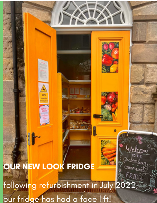
OUR NEW LOOK FRIDGE

We are grateful to our dedicated team, volunteers, and supporters who have made these achievements possible. We remain committed to our mission of supporting our community and look forward to continuing our work in the year ahead.