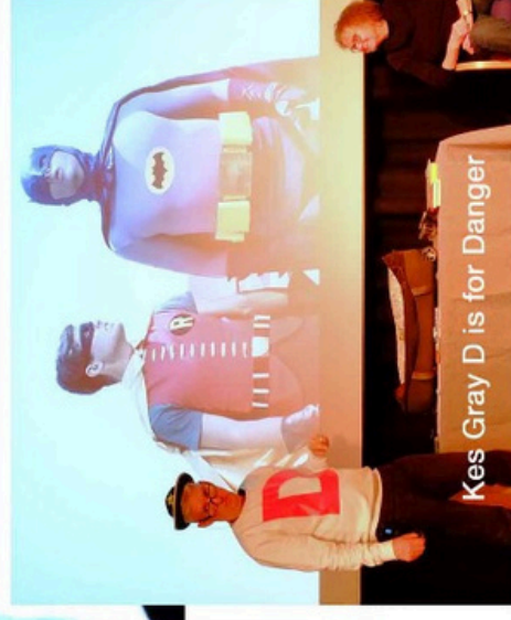
Kes Gray D is for Danger