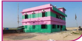
New building of Madrassah