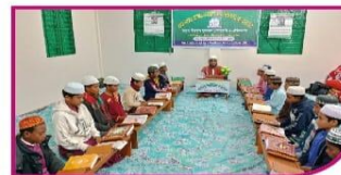
Huffaz memorising Quran

"I and the one who looks after an orphan and provides for him will be in Paradise like this," intertwining his fingers in unity (Sahih Al-Bukhari).