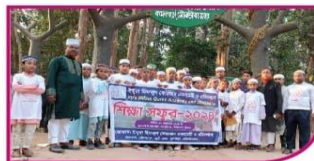
Students are in study tour