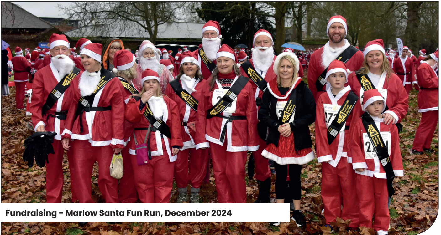
Fundraising – Marlow Santa Fun Run, December 2024