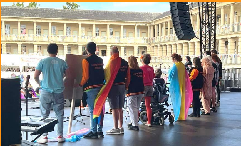
Calderdale Pride 2023, photo by Tina Bown

24 young people took part in 34 sessions 9 of these were new to our choir 12 attended with a parent or carer 12 attended independently 34 parents/carers also attended sessions 6 volunteers supported 1000+ people attended 4 public performances