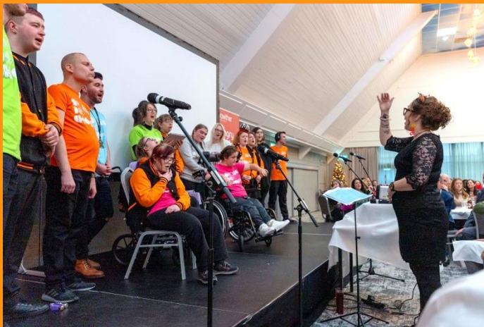
KACCL 2023

Our choir members have been taking it in turns to keep the award at home, so they can share it with family and friends.