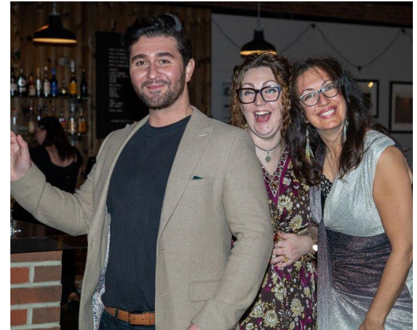
Photo: Community Spirit Awards 2023