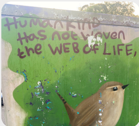
Redruth wall art quoting Chief Seattle 1848