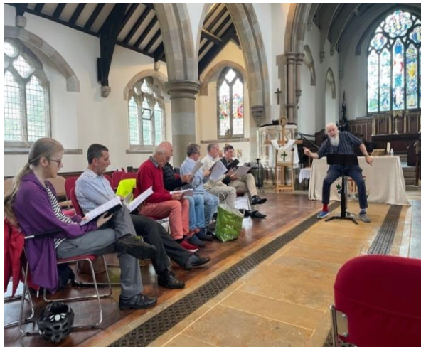
Dutchman Community Chorus Workshop 2023