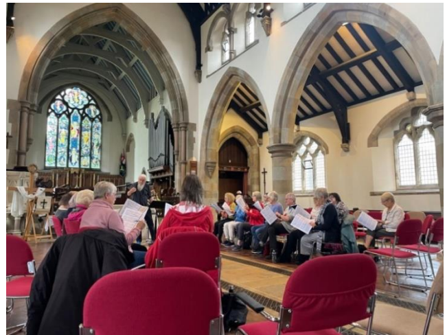
Dutchman Community Chorus Workshop 2023