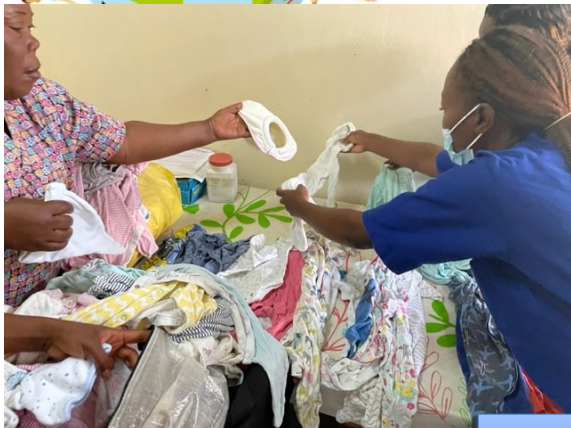
SORTING BABY CLOTHES FOR THE CARE PACKS WITH MIDWIVES