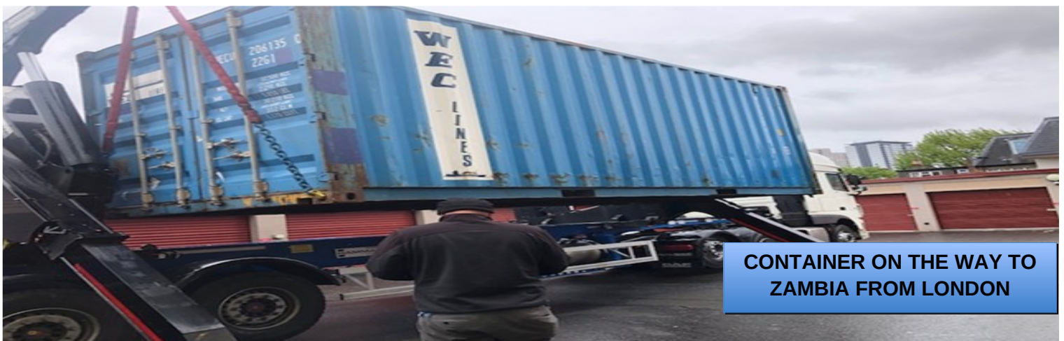
CONTAINER ON THE WAY TO ZAMBIA FROM LONDON