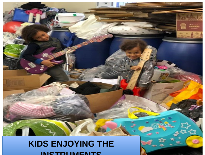
KIDS ENJOYING THE INSTRUMENTS