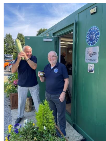
Swapping a marrow for chutney

33. Despite a wet year, some shedders made the allotment work for them, growing carrots, potatoes, marrows etc.