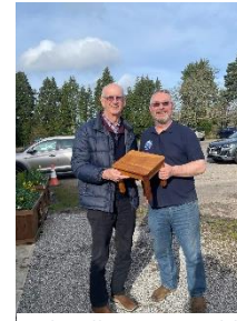
Schoolboy 75 yr- old project repaired