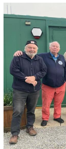
Shoulder to Shoulder