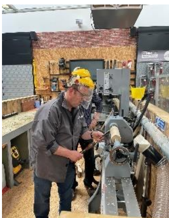
Tuition on lathe at Axminster's Store

32. Some woodworkers in the Shed attended training sessions at Axminster Tools Cardiff Store and also received machine use training at the Shed.