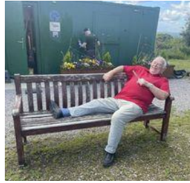
Bench repair in progress