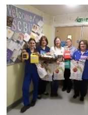
First delivery to Bassetlaw

It has been another busy and exciting year for the Charity especially with our expansion to support the Special Care Baby Unit (SCBU) at Bassetlaw Hospital. Being able to offer our services to other units has been something we have been keen to do for a number of years but it has taken time to find the right place. When I visited Bassetlaw for the first time in January, I knew we had found it! The SCBU is an 8 cot unit that looks after babies from 32 weeks gestation (34 weeks for twins) and has 2 parent rooms. On chatting to the staff, it was clear that they would both appreciate and benefit from the support we offer. As with the work we do for King's Mill, our offer to Bassetlaw is designed specifically around the needs of that unit and the families that use the unit. We officially launched in March, providing them with Welcome Packs, Sibling Boxes, Snack Station, Toiletry Packs, Polaroid Camera and Firesticks. They have also since been included in our gift bag provisions for parents at Easter and on Father's Day.