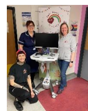
Games Console Delivery

We were also very excited to take delivery of an X-Box console in January, purchased from the Rockin R Charity, as part of our provisions for siblings. This has been placed in the Playroom and has proved a huge hit with siblings and parents alike (perhaps even staff on their breaks!)