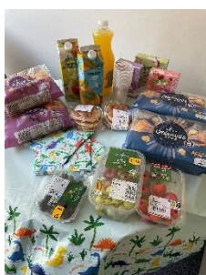
Breakfast for Staff

As always, we are open to new ideas and ways of supporting both units, whether that be to offer something different for families, or increase our efforts to aid staff well-being, and in October, we were excited to begin two new ventures at King's Mill – a Staff Wellbeing Breakfast and Pizza Evening! Both these happen on a monthly basis, the breakfast being facilitated by the hospital psychologist who encourages staff to come, take a break and chat about how things are going, whilst the pizza evening is an opportunity for night staff to enjoy a treat during what can feel a long night shift.