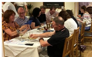
Tackling the quiz at Rossinis