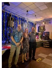
Sutton Darts & Dominoes

The year began with a presentation from the Sutton Darts & Dominoes Club who had chosen us as their charity of the year and raised £750. August and September saw a number of people taking on sporting challenges, including Kent PHK who took on the Yorkshire 3 Peaks, raising over £3,000 in the process! We had 4 runners taking on the Great North Run raising over £3,900 between them and, on the same day, a team from Hydro UK took on a very wet Mansfield 10K, raising over £1,800. August also saw a number of staff from Eviosys taking part in a Charity Football Match, well supported by family and friends, all raising almost £1,200. You are all amazing and thank you so much!