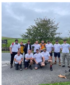
Kent PHK 3 Peaks Challenge