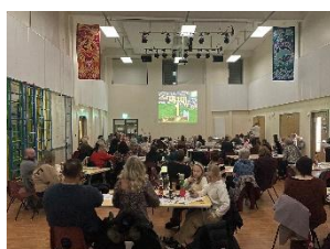
Race Night fun!

Of course it wouldn't be a complete year without us hosting a couple of fundraising events of our own – this year saw the return of our very popular Race Night in November and then a Charity Meal at a new venue, Rossini's, an Italian restaurant in Mansfield Woodhouse. Both were well supported and enable us to both raise money but also meet some of our fabulous supporters and thank them in person for all they do for us. Do follow us on Social Media to find out about upcoming events that you are more than welcome to come along to!