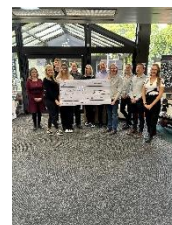
Hydro UK Presentation

Of course it wouldn't be a complete year without us hosting a couple of fundraising events of our own – this year saw the return of our very popular Race Night in November and then a Charity Meal at a new venue, Rossini's, an Italian restaurant in Mansfield Woodhouse. Both were well supported and enable us to both raise money but also meet some of our fabulous supporters and thank them in person for all they do for us. Do follow us on Social Media to find out about upcoming events that you are more than welcome to come along to!