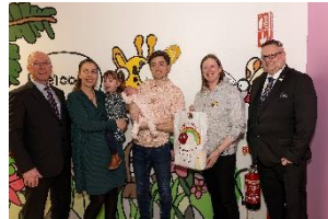
Donation from St Peters Lodge