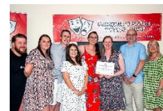
Presentation Night at the Hospitals Troupe

The year started brilliantly with a visit to the Mansfield Hospitals Theatre Troupe Presentation Evening where we received a donation for £1500 as part of their incredible fundraising from the Pantomime. We enjoyed a fun evening of entertainment as well as some good food and it was great to meet those involved in the Pantomime!