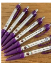
Pens for all staff

The hospital also continue to make requests for things that will enhance their care of the babies or that will help to promote important information so some other items we have been able to purchase this year have included an ice machine for the parents flats and pens for all the staff to use which remind them of the steps to take to encourage breast feeding and the expression of breast milk.