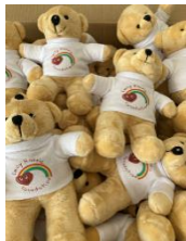
Sibling Teddy Bears

As always, we are continuously looking for new ways to support the unit and this year we were given a donation to purchase teddy bears for siblings who are visiting their baby brother or sister. These have been hugely popular and we have just placed an order for a further 100 teddies to be given out over the coming year!