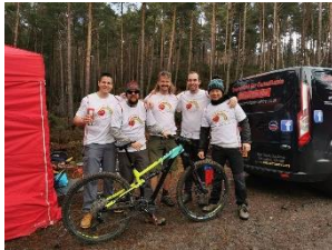
The start of Strathpuffer 24

As always, we couldn't do what we do without the incredible support of those businesses and individuals who raise money for us and continue to show generosity despite the challenges they face. We have had people complete the London Marathon, Great North Run, Scotland Coast to Coast, Strathpuffer 24 challenge and many other things over the year – too many to mention but we are so grateful for every penny raised.