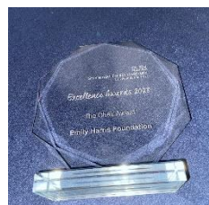
The Chair Award

Despite the on-going pressures we are all facing with the aftermath of the Covid Pandemic and the cost of living crisis, we have been amazed to see that our fundraising has not been adversely affected this year – the generosity of those who support us has continued to astound us and we have recorded another bumper year of income, alongside great attendance at our fundraising events. We were delighted to reach a fabulous milestone just prior to Christmas of raising over £250,000 since the charity began. This resulted in East Midlands Today filming a feature which was shown at the beginning of February and which can be viewed here for anyone who missed it! We are now well on the way to reaching £300,000 and look forward to celebrating more milestones in the months and years to come.