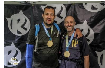
Completed Scotland Coast to Coast