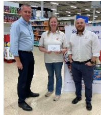
Donation from Tesco