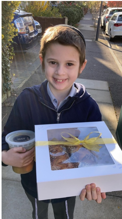
Delivery of food package containing homemade bread and soup

The packages are also offered in the case of a bereavement, birth or the like.