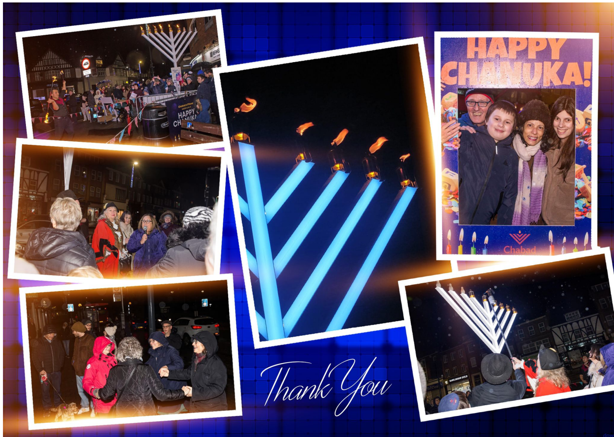
Chanukah Celebration: Images from our Chanukah celebration event on Pinner High Street