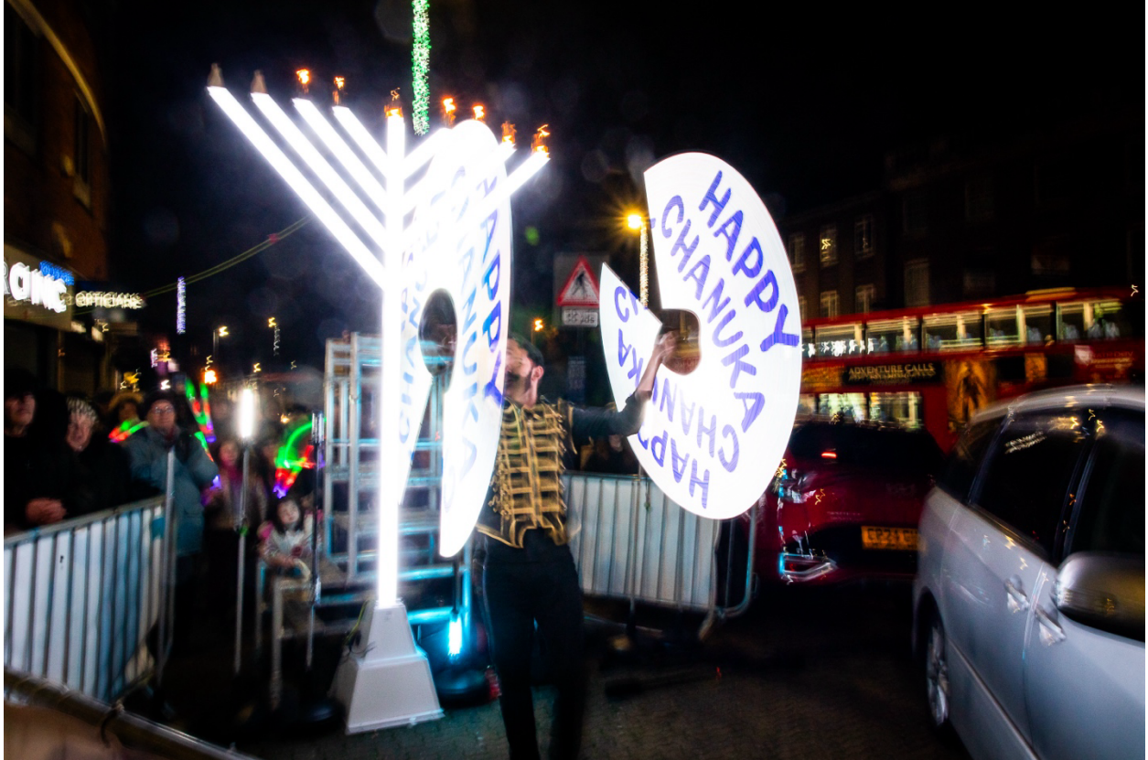
Chanukah Celebration: Image from our Chanukah celebration event on Pinner High Street