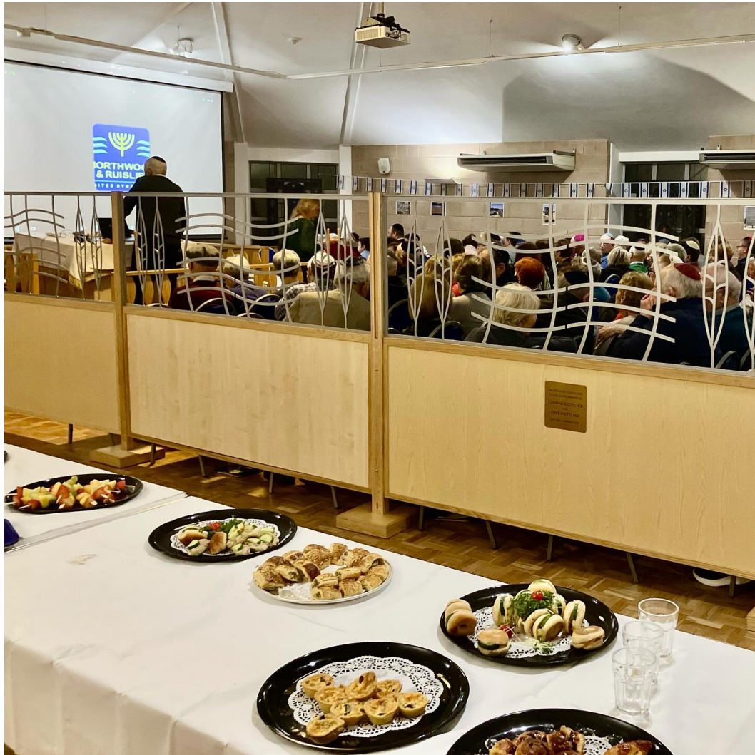
Example of food served at communal festive meal

These provide an opportunity for our community to come together and celebrate good, joyous times, spreading cheer and goodwill and wishing each other good tidings