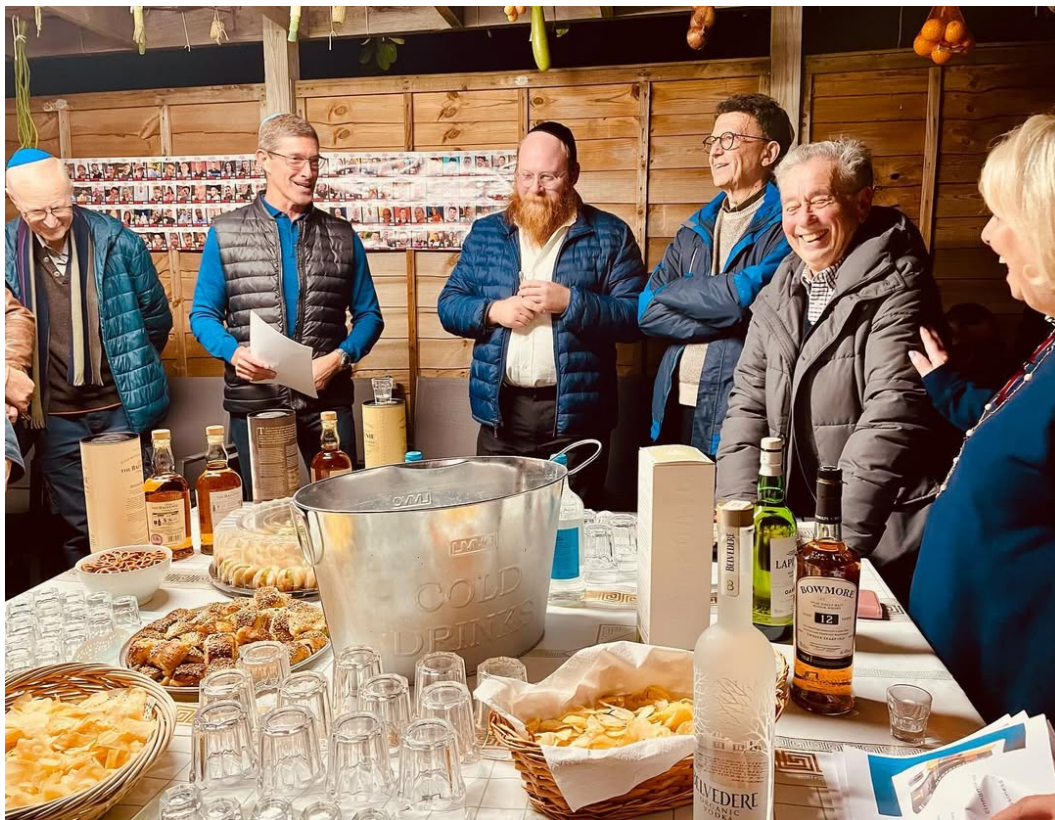
Examples of events hosted during the year

Events are interactive, in a relaxed setting and welcoming. They provide an opportunity to the community to socialise and widen their circle of friends.