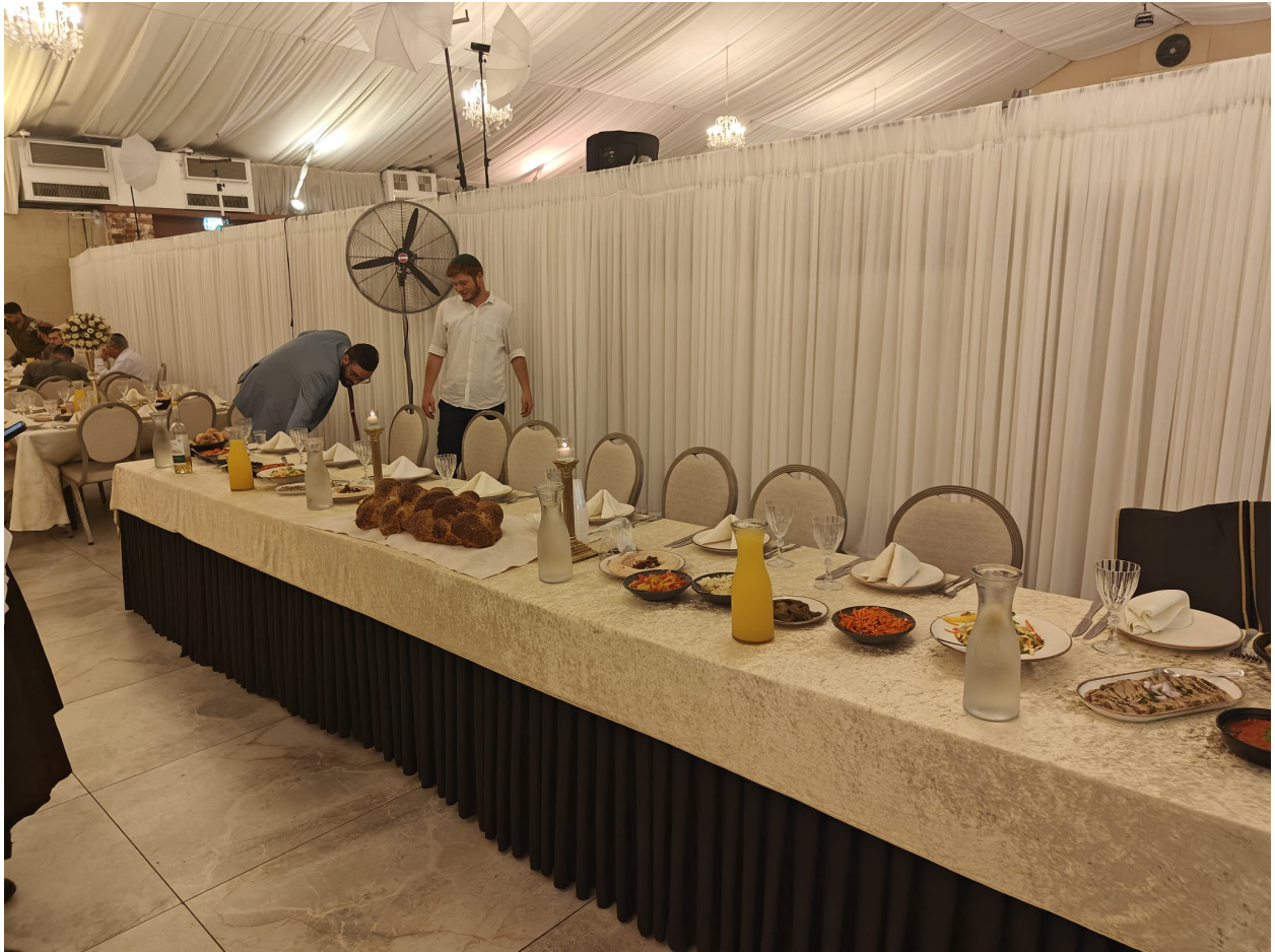
Example of food served at communal festive meal