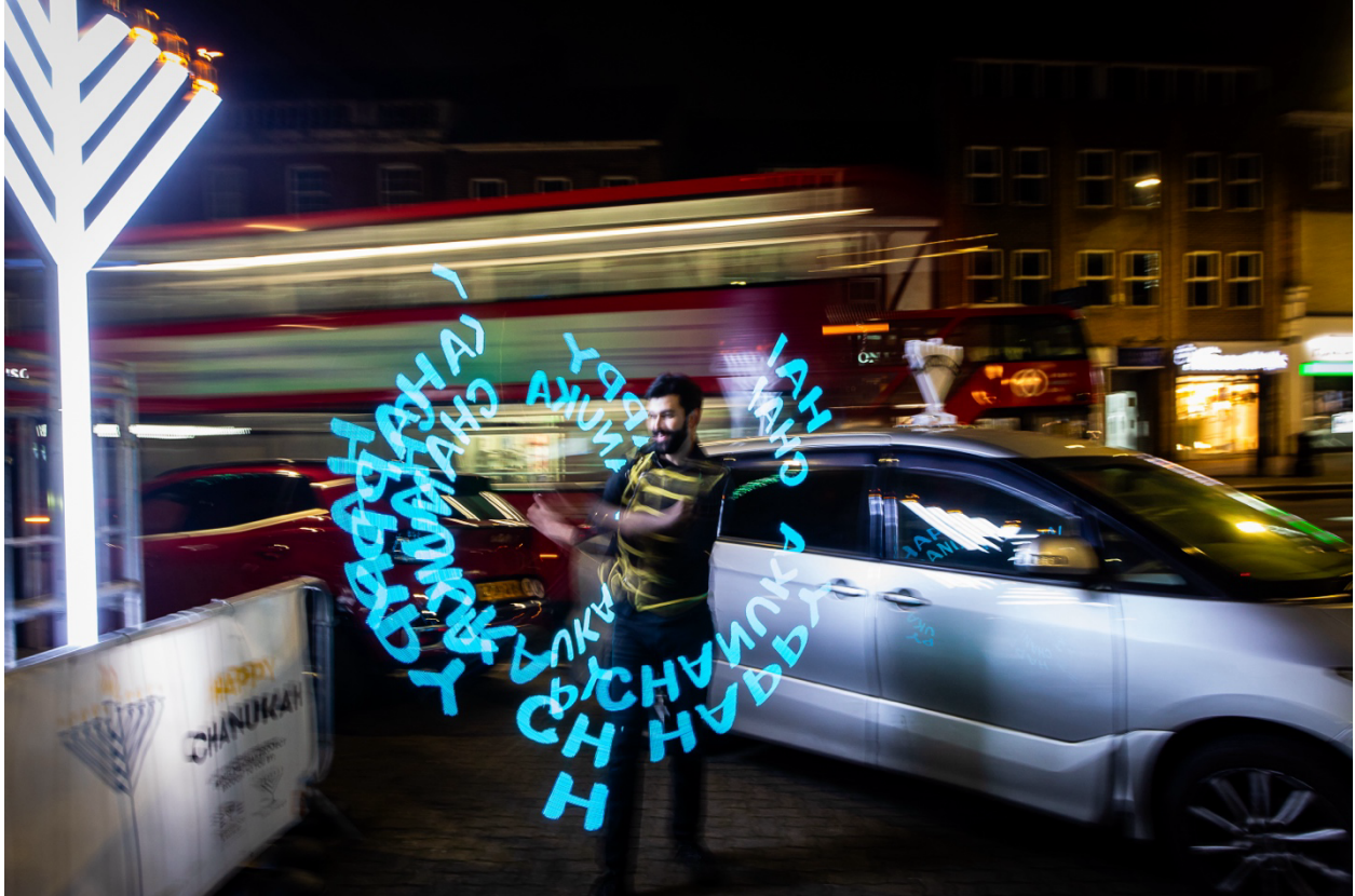
Chanukah Celebration: Image from our Chanukah celebration event on Pinner High Street