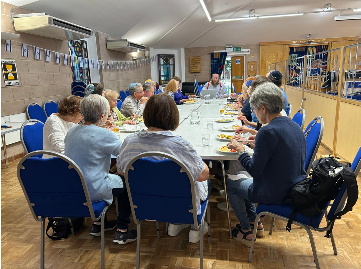
Examples of events hosted during the year

3. We host multiple community dinners and parties throughout the year.