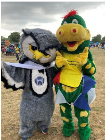
Deano and his friend Olly the Owl at this years Medway Mile

We have continued to offer virtual support online, including an Asthma Advent Calendar and newsletters. In more recent times we have appreciated the many events that have taken place locally that we have been able to participate in, including Safety in Action Day, School Jubilee Fayres, Coffee Mornings and Fresher's Week. Deano, our mascot, has also been back in action at the Medway Mile whilst also celebrating the Queen's Platinum Jubilee!