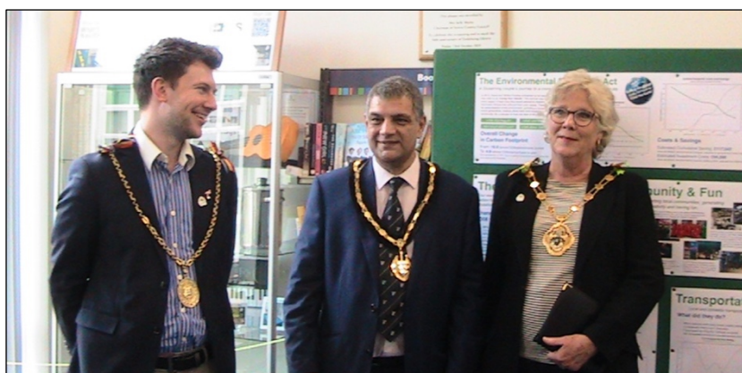
The Mayor of Godalming, the Chair of Surrey County Council and the Mayor of Waverley Borough Council at the launch of our Library of Things

In October 2023, we launched our Library of Things . This is a collaborative project with Godalming Library providing 'front-of-house' service, issuing and collecting items, Waverley Borough Council providing storage for our items and What Next volunteers organising the actual library, including on-line booking and stock management, transfers of items and maintenance / PAT testing. As of March 2024, we have 50 items in our library, 90% of which have