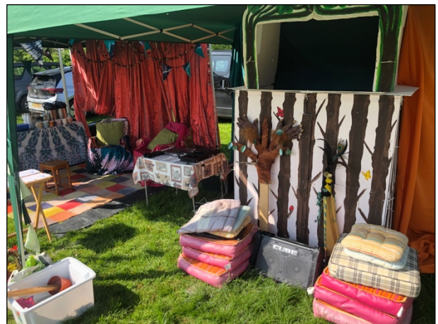
The What Next Lounge & Puppet Theatre