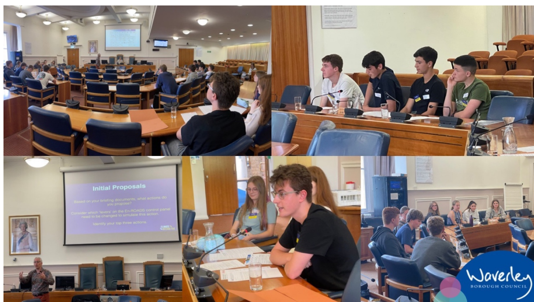
Climate Action Negotiation Workshops in Waverley Borough Council Chambers

Our Climate Action Workshops for the general public, along with our Climate Action Negotiation Workshops for school and college students in Waverley, are another significant achievement. The former has attracted a wide-range of individuals from the climate curious to climate activists, all of whom would have left the workshops with an enhanced understanding of what is most impactful in mitigating climate change. The latter, negotiation workshops, have been organised in collaboration with Waverley Borough Council and were held in the council chambers; three of the events were chaired by the Mayor of Godalming. More than 150 students have taken part in these workshops some of which were also attended in part by local councillors. We believe that there has been significant public benefit from running these workshops, specific examples of individuals changing their behaviour or being inspired to influence others have been shared with us anecdotally. We have also been asked to run additional workshops for other groups both within Waverley and beyond.