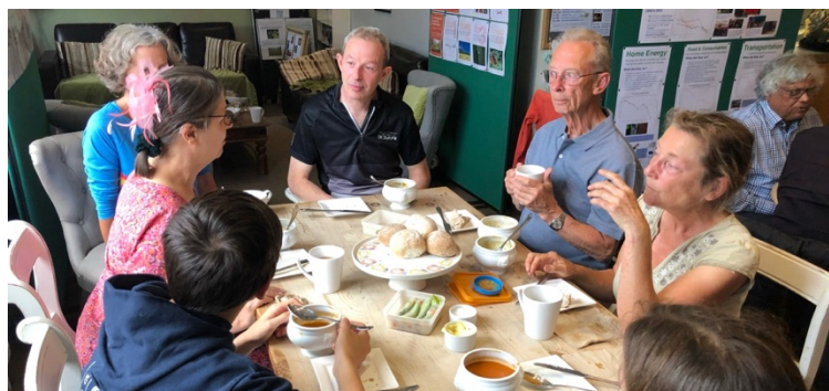
Our Climate Club

Our Climate Action Workshops for the general public, along with our Climate Action Negotiation Workshops for school and college students in Waverley, are another significant achievement. The former has attracted a wide-range of individuals from the climate curious to climate activists, all of whom would have left the workshops with an enhanced understanding of what is most impactful in mitigating climate change. The latter, negotiation workshops, have been organised in collaboration with Waverley Borough Council and were held in the council chambers; three of the events were chaired by the Mayor of Godalming. More than 150 students have taken part in these workshops some of which were also attended in part by local councillors. We believe that there has been significant public benefit from running these workshops, specific examples of individuals changing their behaviour or being inspired to influence others have been shared with us anecdotally. We have also been asked to run additional workshops for other groups both within Waverley and beyond.