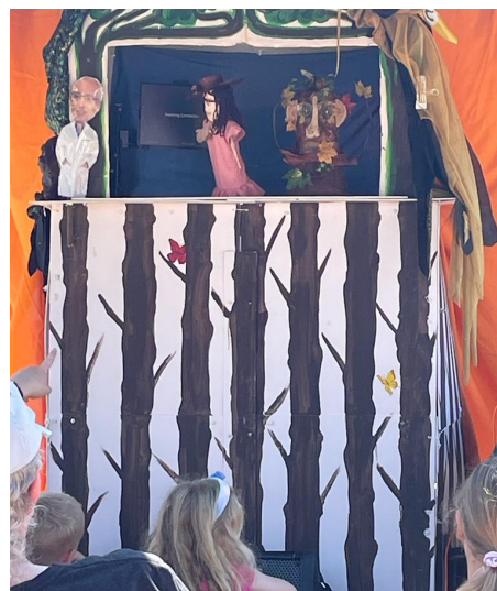
Our 'Rubbish' Puppet Theatre

The activities of our Eco-theatre Group have also been notable. Their first production: 'Everybird goes to COP' was presented in Godalming High Street on the middle weekend of COP26 and created a fantastic platform for announcing the existence of What Next in Waverley. It also introduced the What Next Earth Sprites to the citizens of Godalming and they have been a recurring presence in various shows and activities ever since. More recently, the group have turned their attention to their 'Rubbish' Puppet Theatre, a puppet theatre made (almost) entirely of discarded objects and materials, with their production of 'The Green Lead Awards' which was performed at the Godalming Green Gala. This group provides a unique platform for entertaining, informing and influencing the citizens of Godalming.