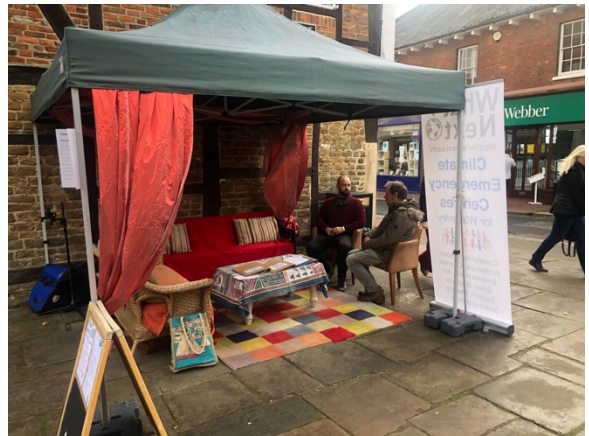
The What Next Lounge