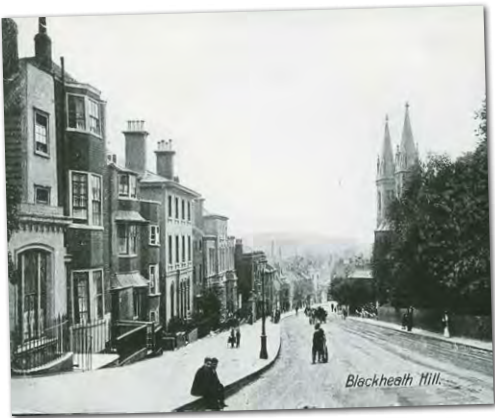
Blackheath Hill in 1906