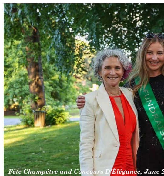
Fête Champêtre and Concours D'Élégance, June 2024