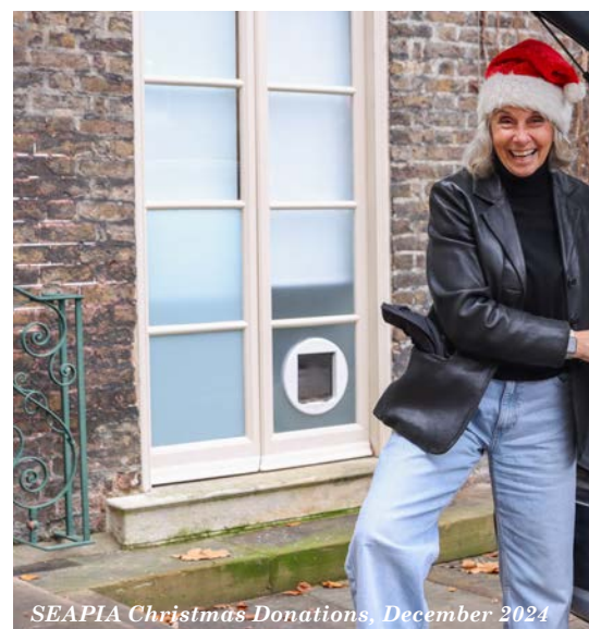
SEAPIA Christmas Donations, December 2024