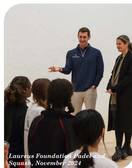
Laureus Foundation Padel and Squash, November 2024

They even got to meet two gold medal winning Olympians as part of the project. The girls are really enjoying this opportunity, developing excellent skills and building healthy habits and confidence as the weeks go on.