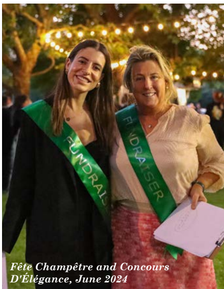
Fête Champêtre and Concours D'Élégance, June 2024