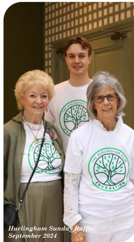
Hurlingham Sunday Raffle, September 2024

going concern basis unless it is inappropriate to presume that the Charity will continue in business.