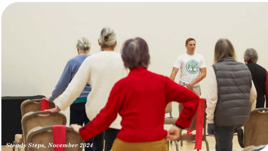
Steady Steps, November 2024