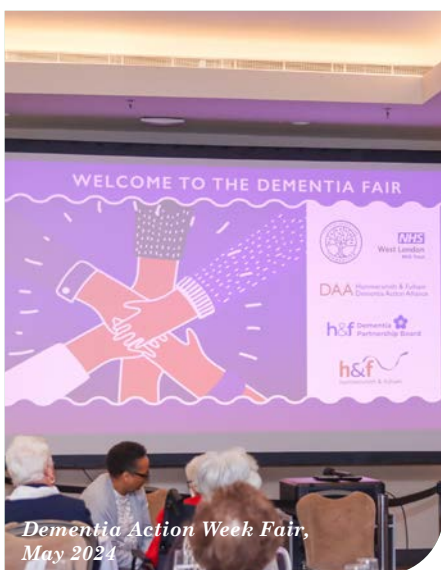
Dementia Action Week Fair, May 2024

possible. Total expenditure in the period amounted to £98,668 of which £84,839, over 85%, was spent directly on community projects. The Foundation deliberately increased its project expenditure in the year and spent more than it raised in 2024 to maximise our impact and to be in line with our reserves policy.