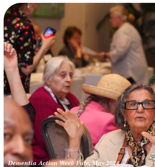
Dementia Action Week Fair, May 2024

The Trustees confirm they are aware of and have referred to the guidance from the Charity Commission on public benefit and complied with the duty in Section 17 of the Charities Act 2011 to have due regard to the Commission's public benefit guidance when reviewing the Foundation's aims, objectives and future activities.