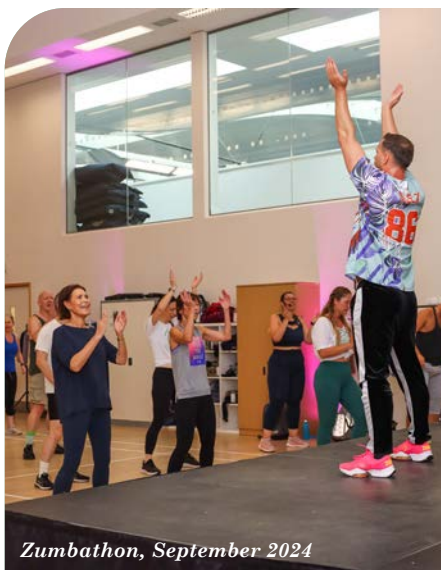
Zumbathon, September 2024