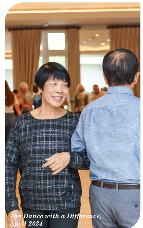
Tea Dance with a Difference, April 2024